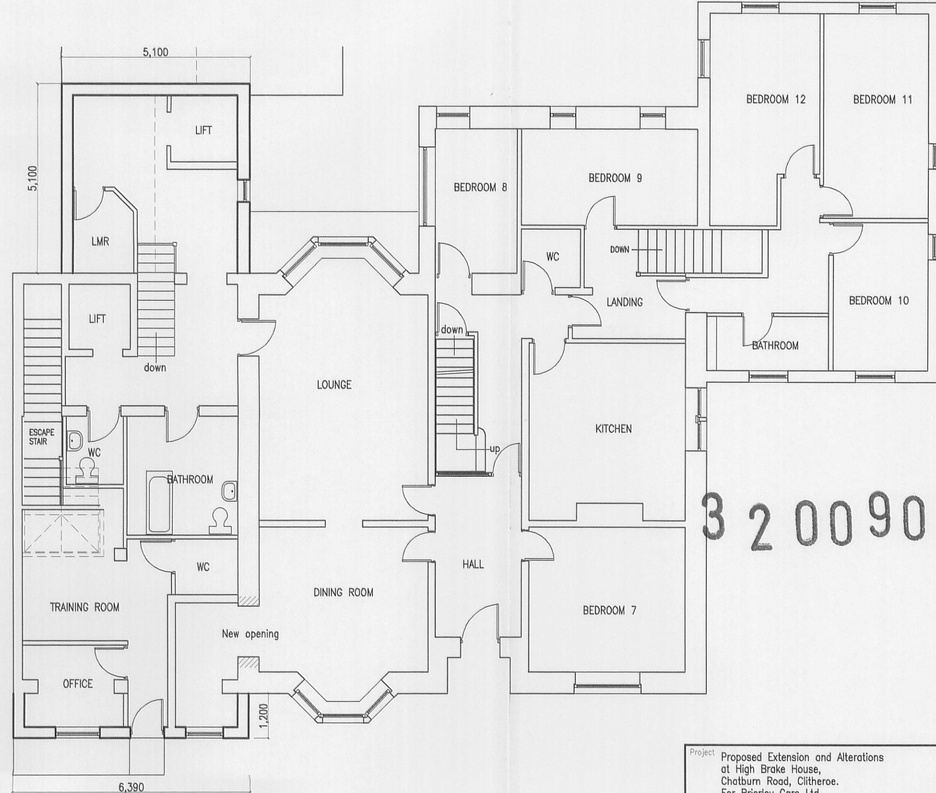
EX BUILDING GROUND FLOOR PLAN