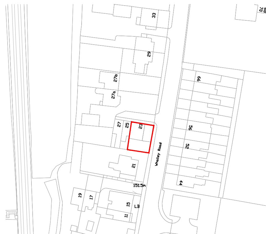
SITE LOCATION PLAN - 200sqm 1:1250@A3