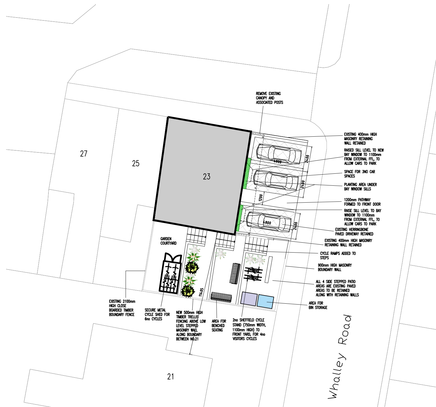
PROPOSED BLOCK SITE PLAN 1:200@A3