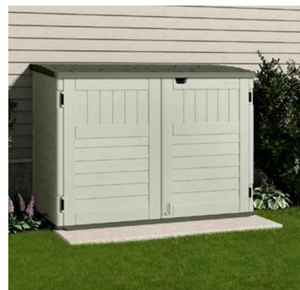
LOCKABLE WHITE PLASTIC EUROBIN STORAGE UNIT, WITH OPENABLE LID FOR BIN USE, AND DOUBLE LOCKABLE DOORS FOR EASY ACCESS/EGRESS