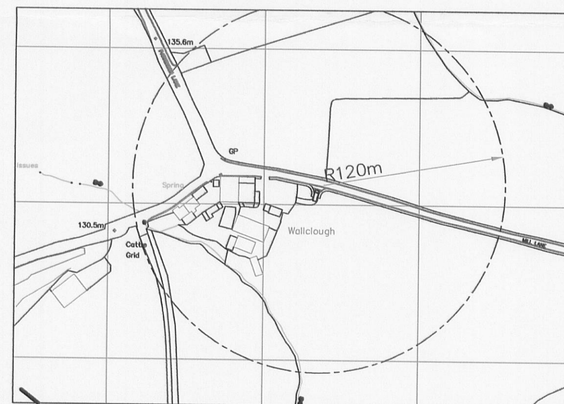
O.S. Map Scale 1:2500

The proposed area back from the hard metallised carriageway to be hard surfaced for a minimum of 2.40m in Tarmac, Concrete, Stone Sets or equivalent.