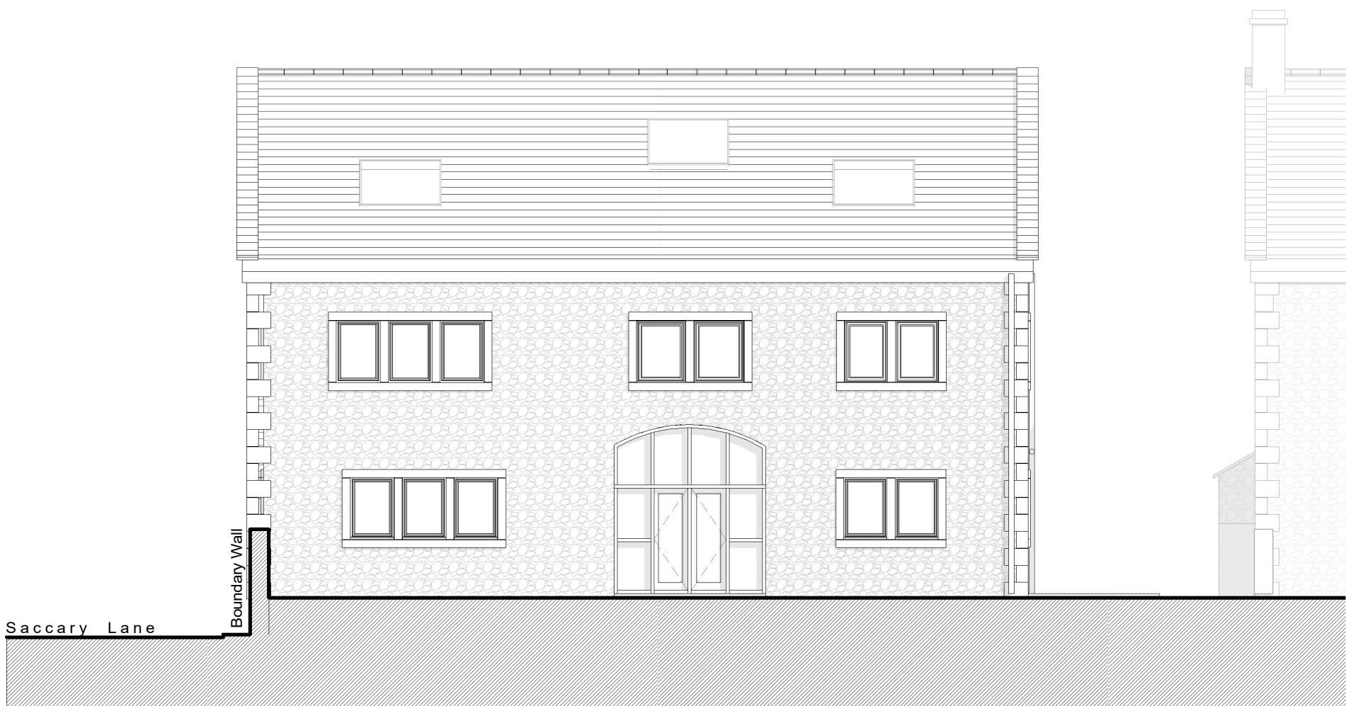
1 Proposed Front Elevation (South) 1 : 100