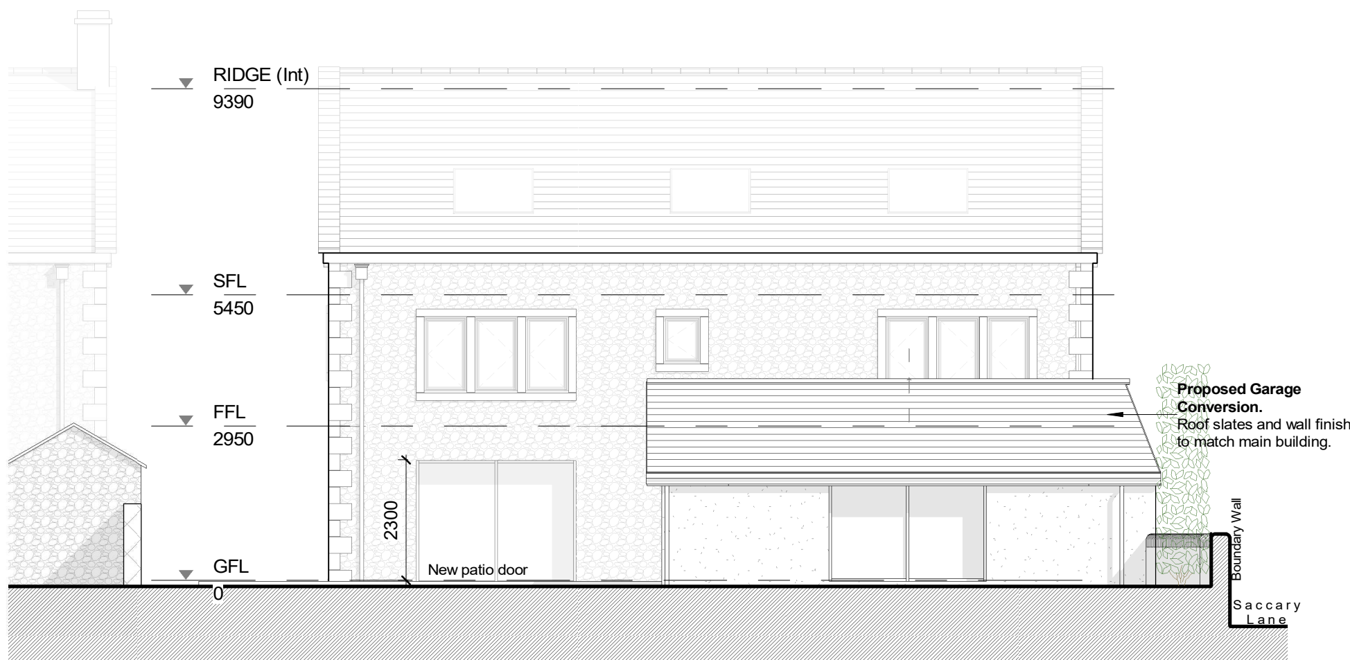
3 Proposed Rear Elevation (North) 1 : 100