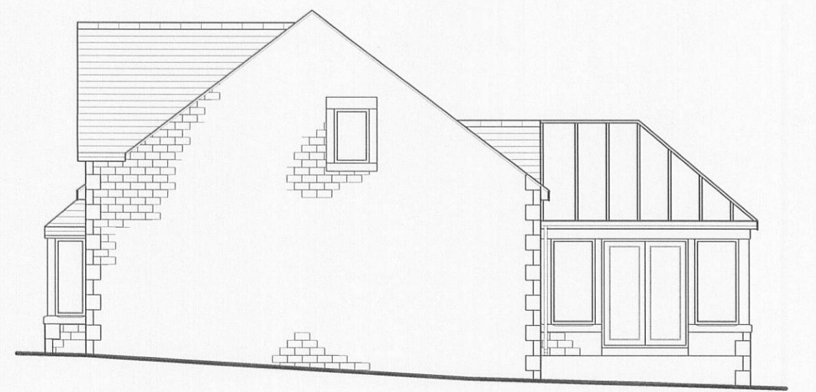
North East Elevation 1:100

Rev B - Gable removed from front elevation and roof pitch amended to reduce overall height by 350mm - 30/06/11 AMH Rev A - Dimensions added to site plan - 11/03/11 AMH