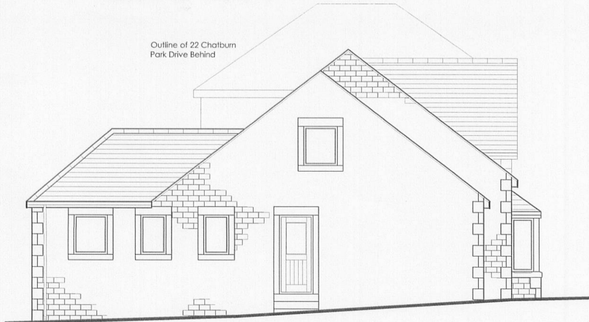
South West Elevation 1:100