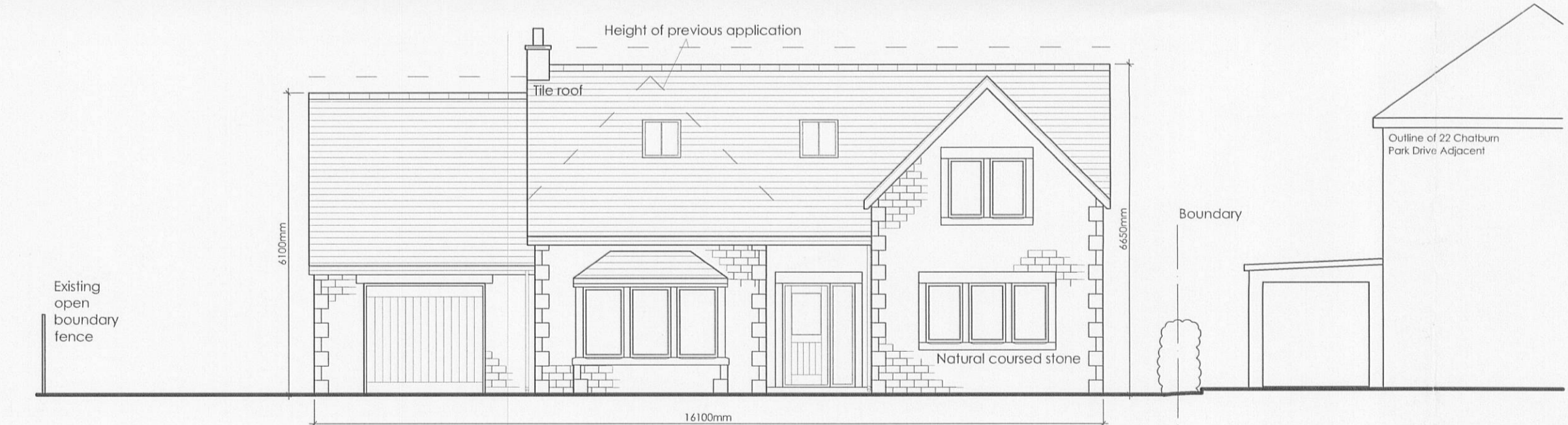
South East Elevation 1:100