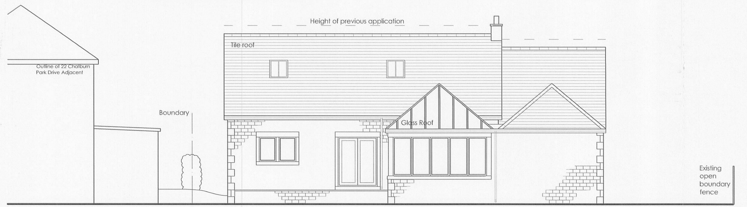
North West Elevation 1:100