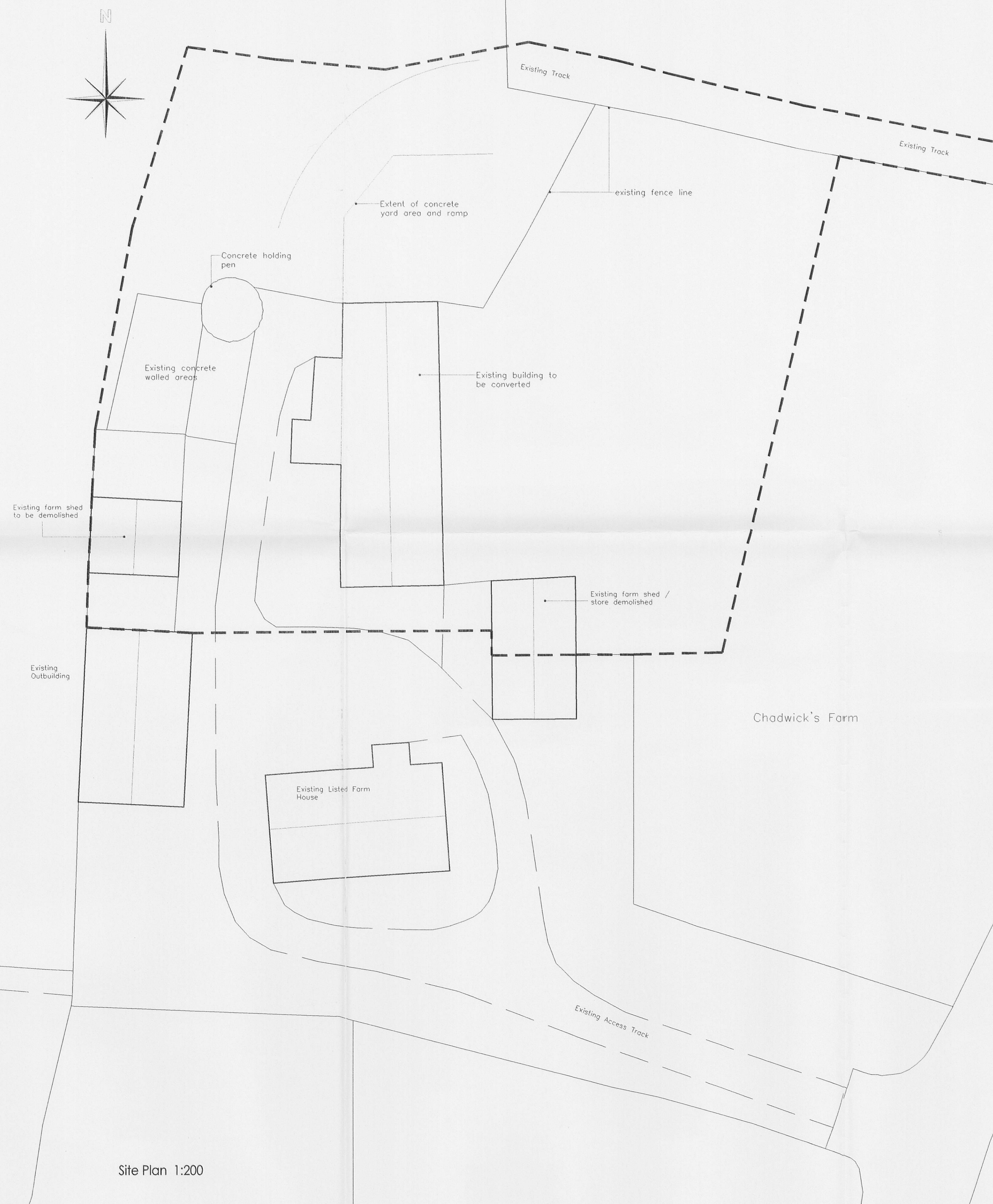
Site Plan 1:200

Revisions: A: Feb 2012 Revised planning application