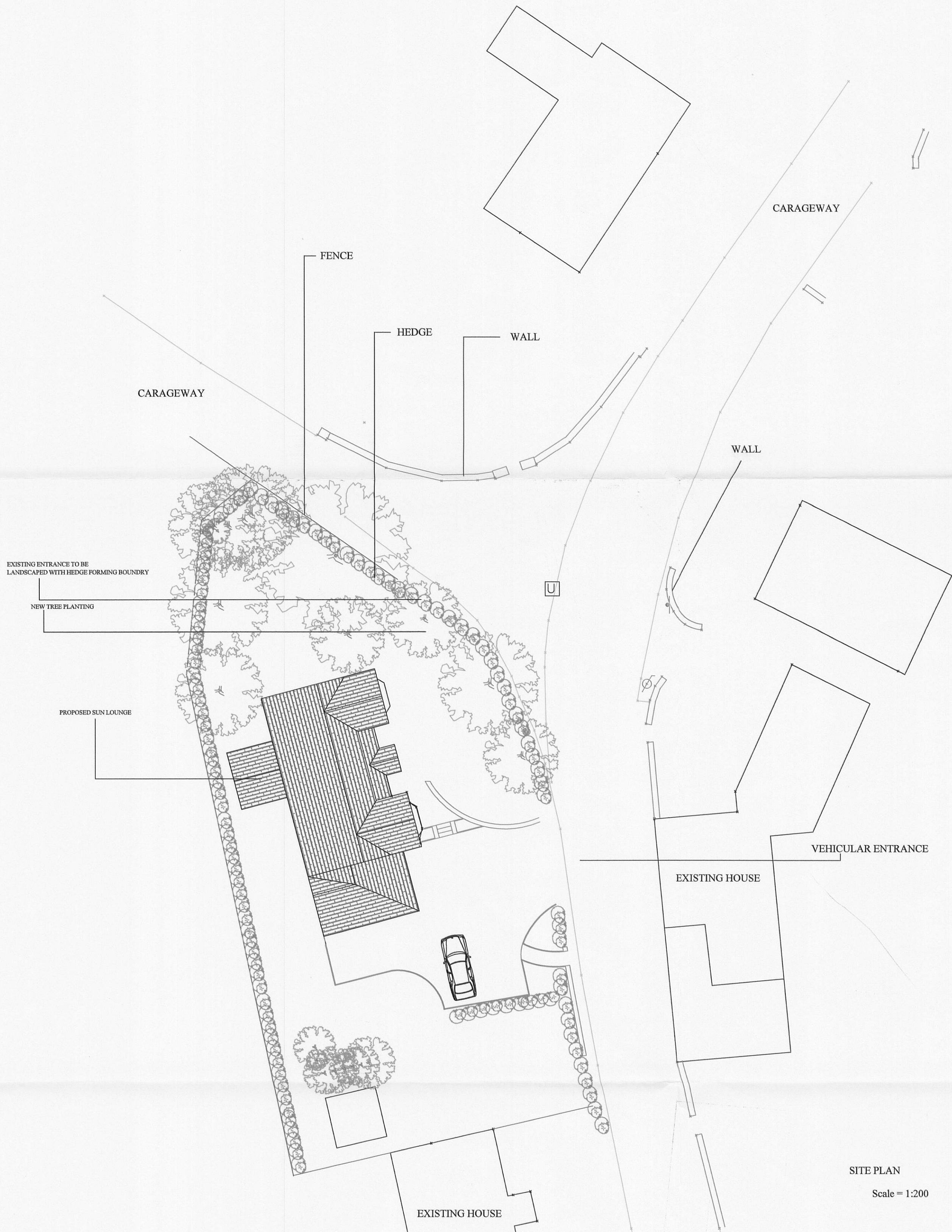
SITE PLAN Scale = 1:200