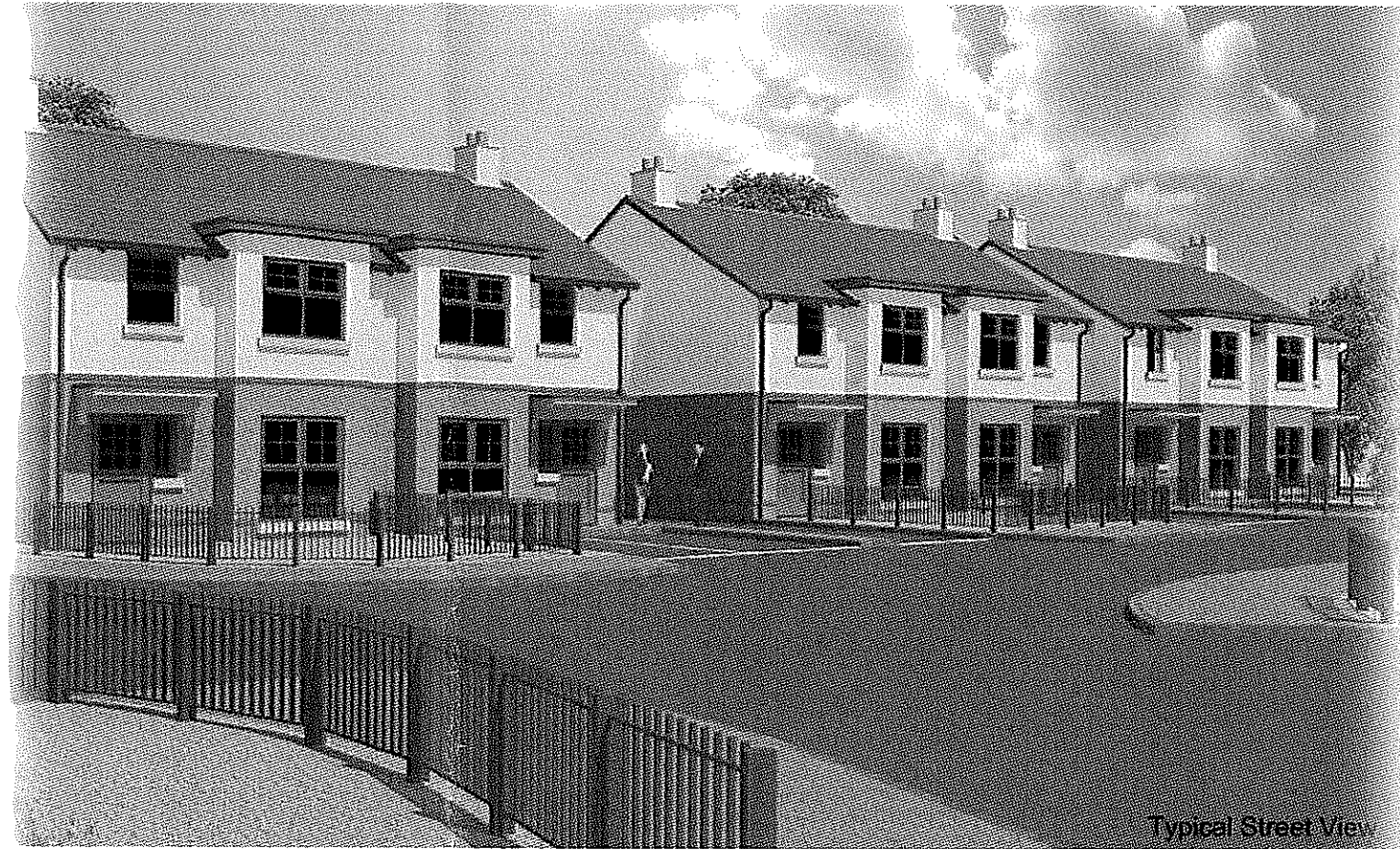
Typical Street View

Bird boxes to be incorporated into the brickwork in key locations within the development. Manufacturer and position TBC / Approved with L.A.