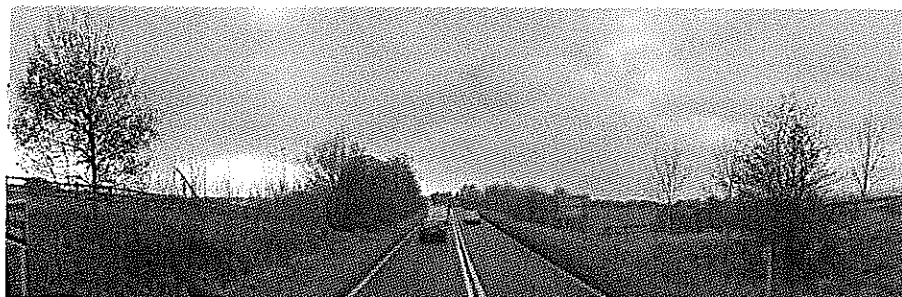
Existing view of Plots 13-15 from the A59 - view facing north east