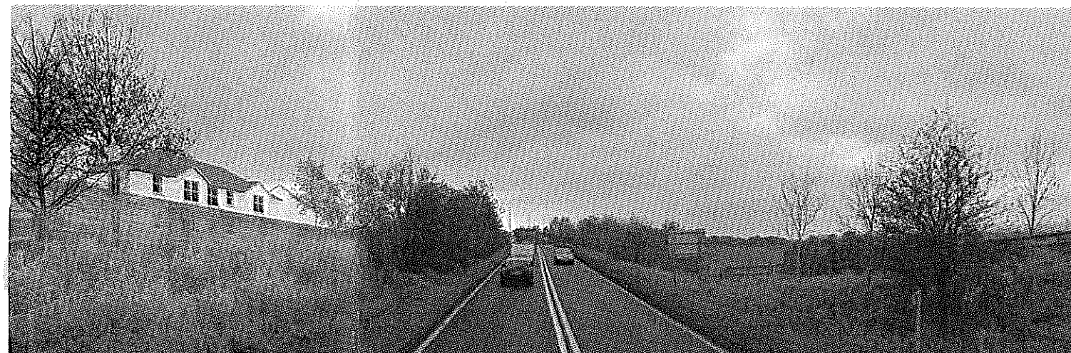
Proposed view of Plots 13-15 from the A59 - view facing north east