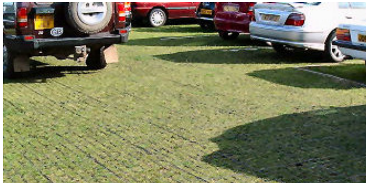
Finished Appearance of Grass Paviors

This construction method gives the illusion that the field has not been touched, when in fact the applicant will be able to use the 'track' on a daily basis without issue.