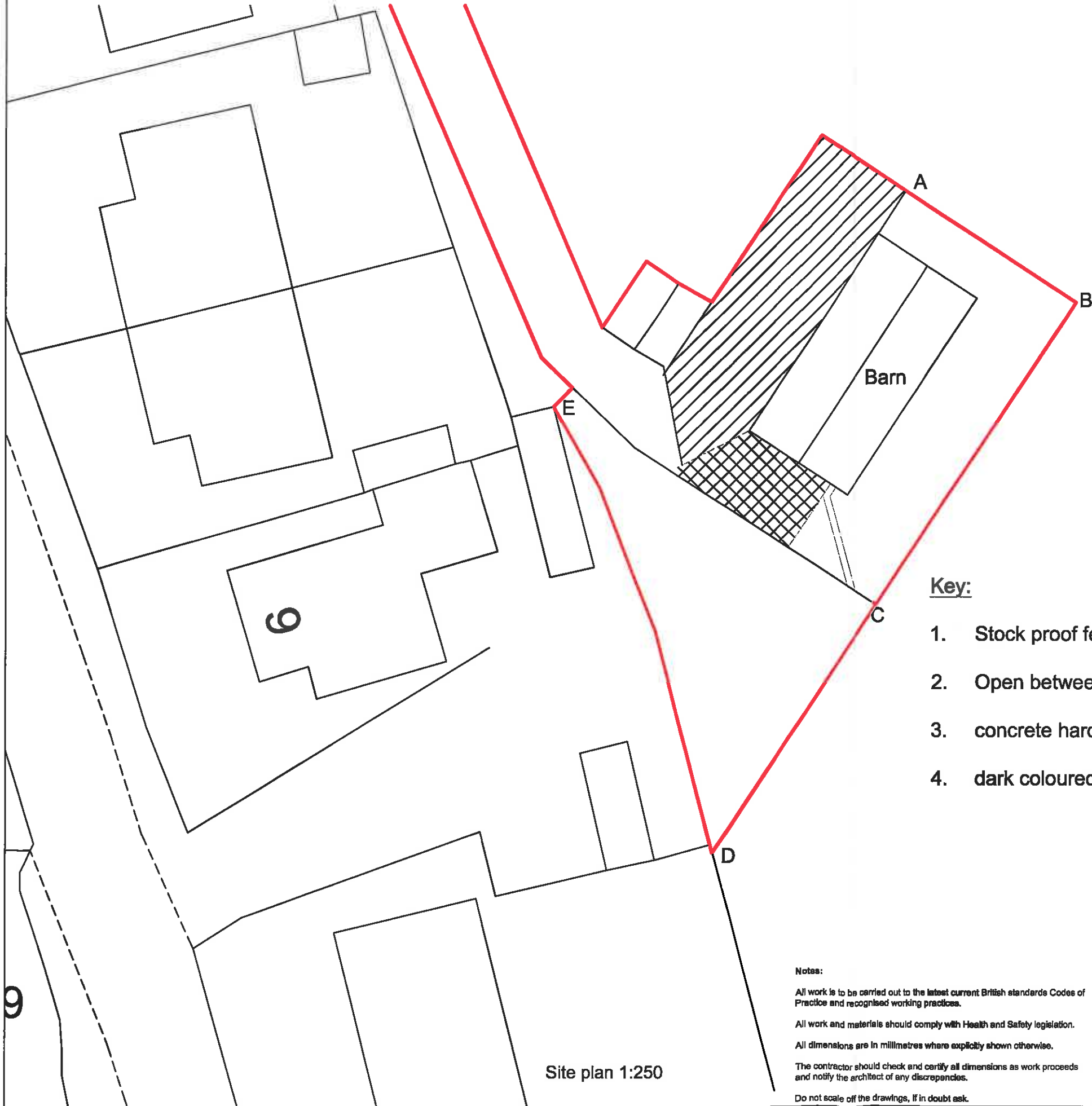
Site plan 1:250

Retrospective planning application for amendment to landscaping & boundary details to planning permission 3/2008/1005 for the conversion of a barn into a residential dwelling at Whinney Lane, Langho, Blackburn, BB6 8DQ~