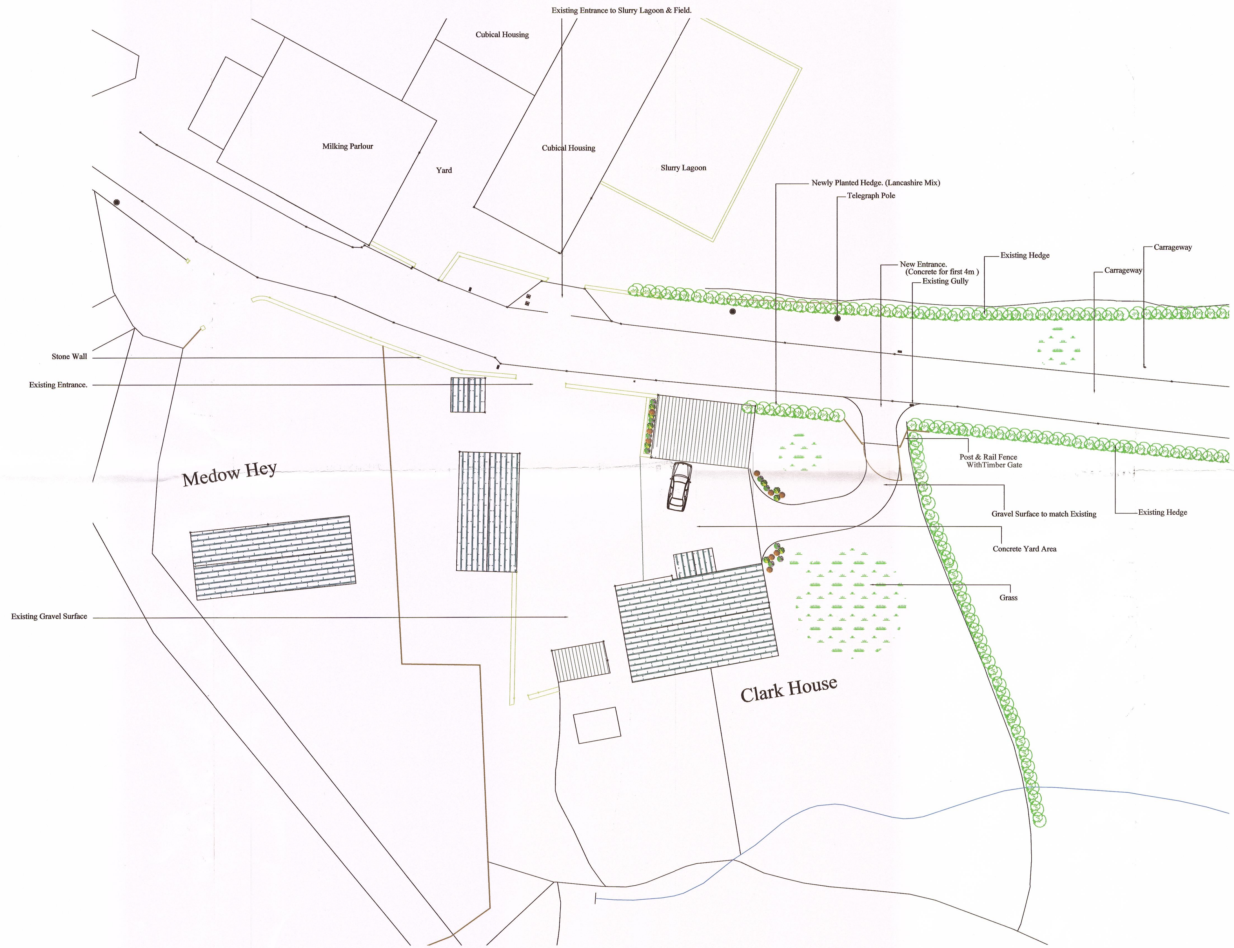
Post & Rail Fence