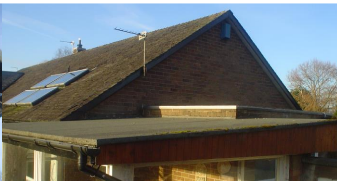
Felt flat roof