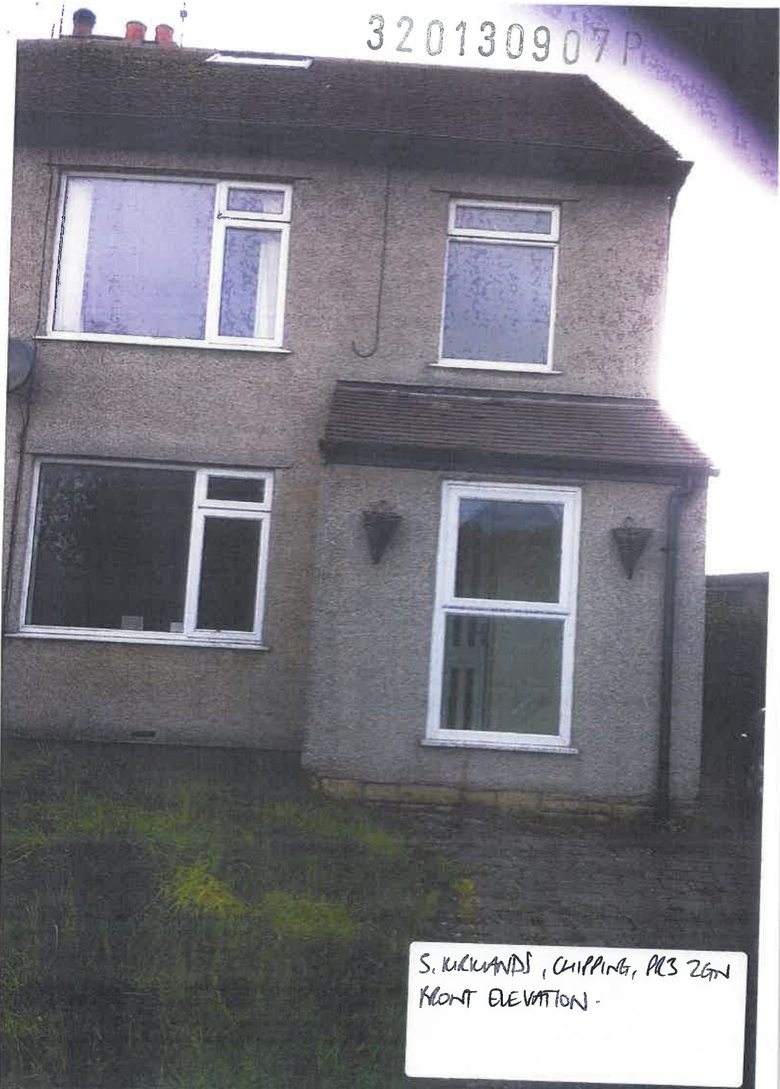
S. KIRKLANDS, CHIPPING, PC3 2GN FRONT ELEVATION.