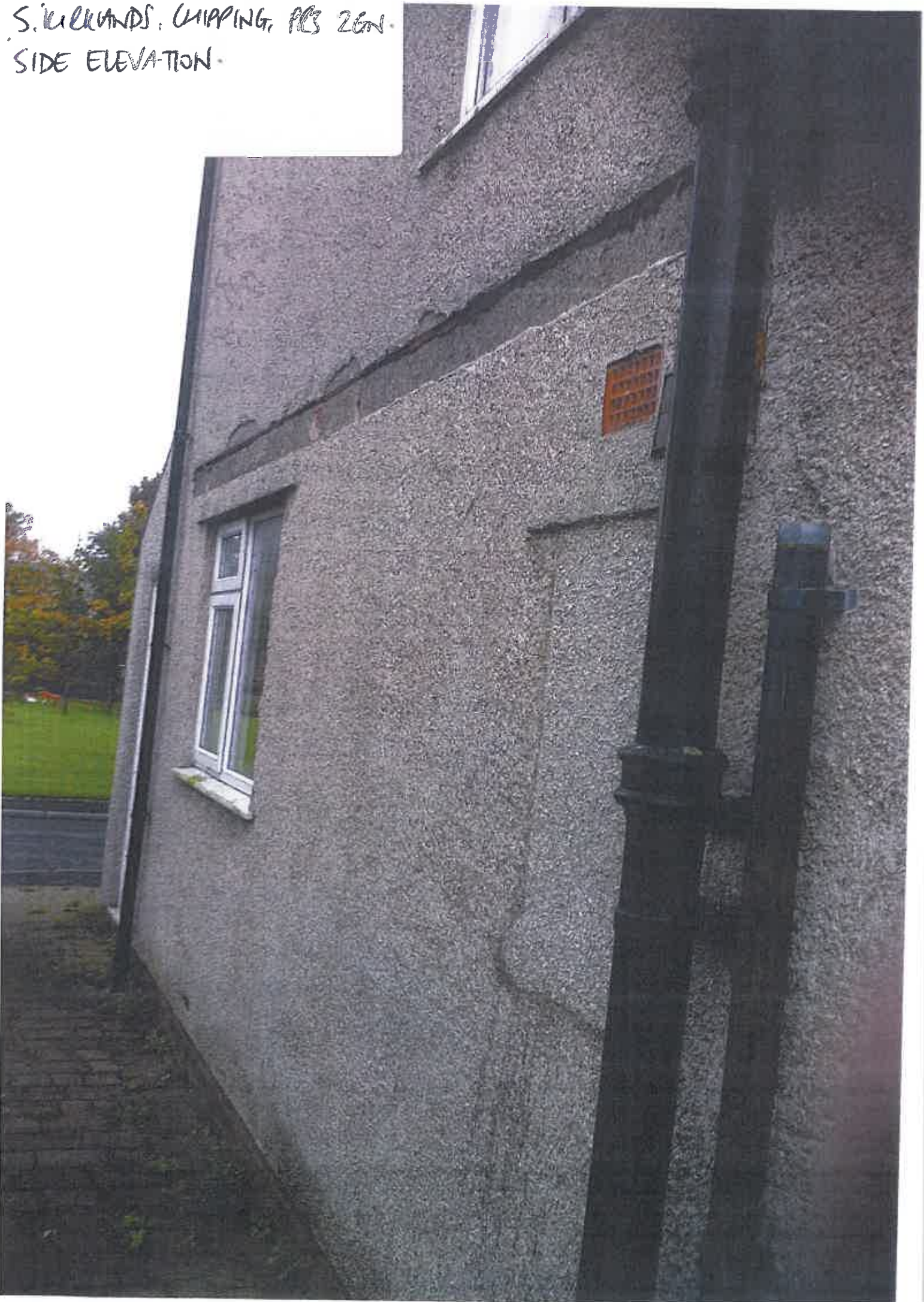
S. WICKLANDS, CHIPPING, PG 26N. SIDE ELEVATION.