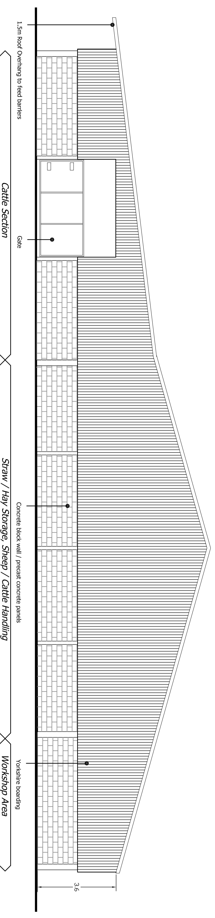
Side Elevation (South Facing)