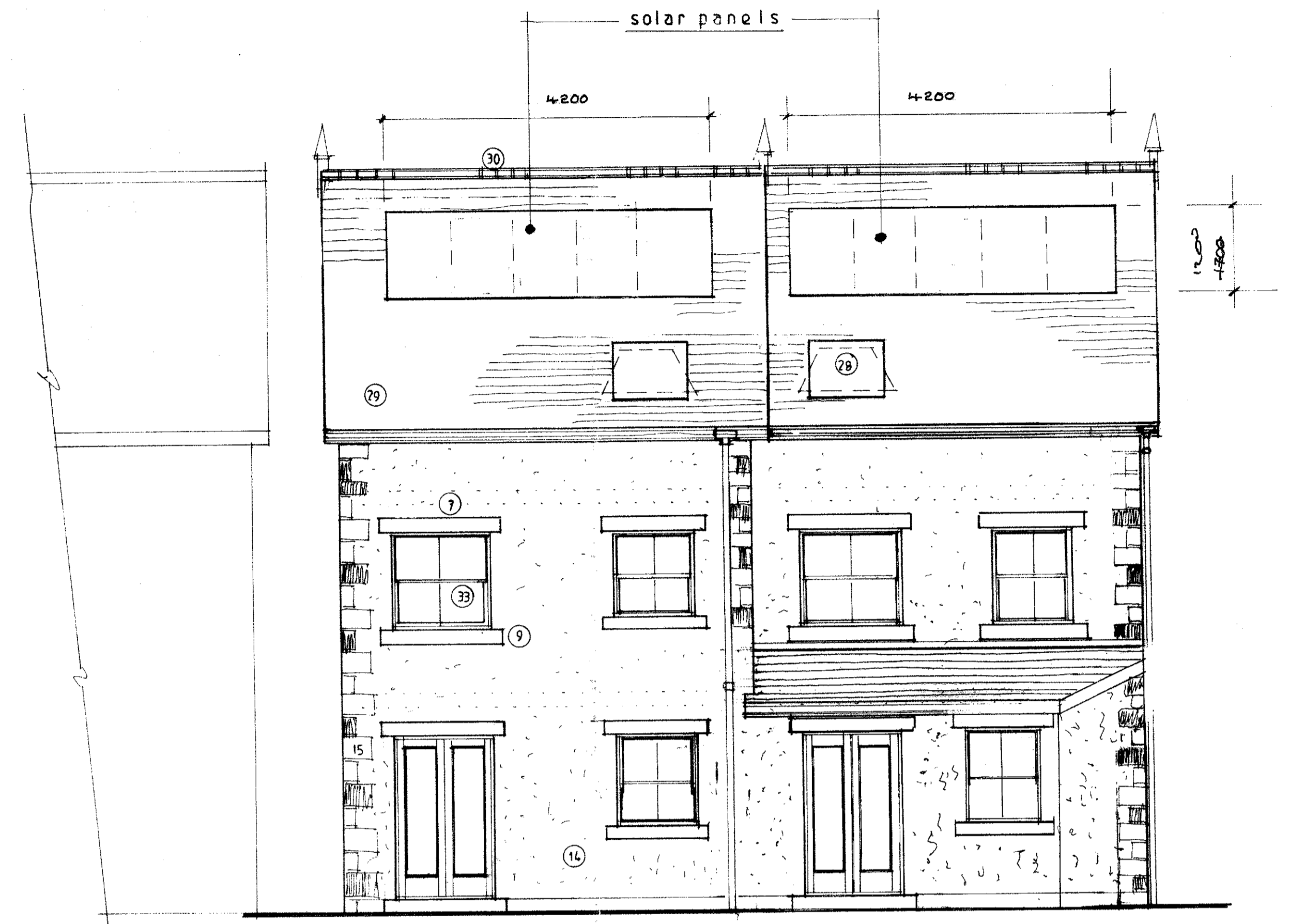
s o u t h