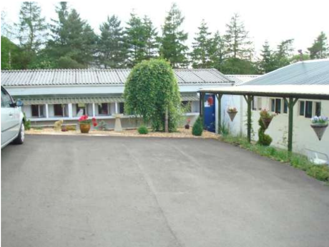
Photograph 6 – View from driveway looking south west towards kennels.