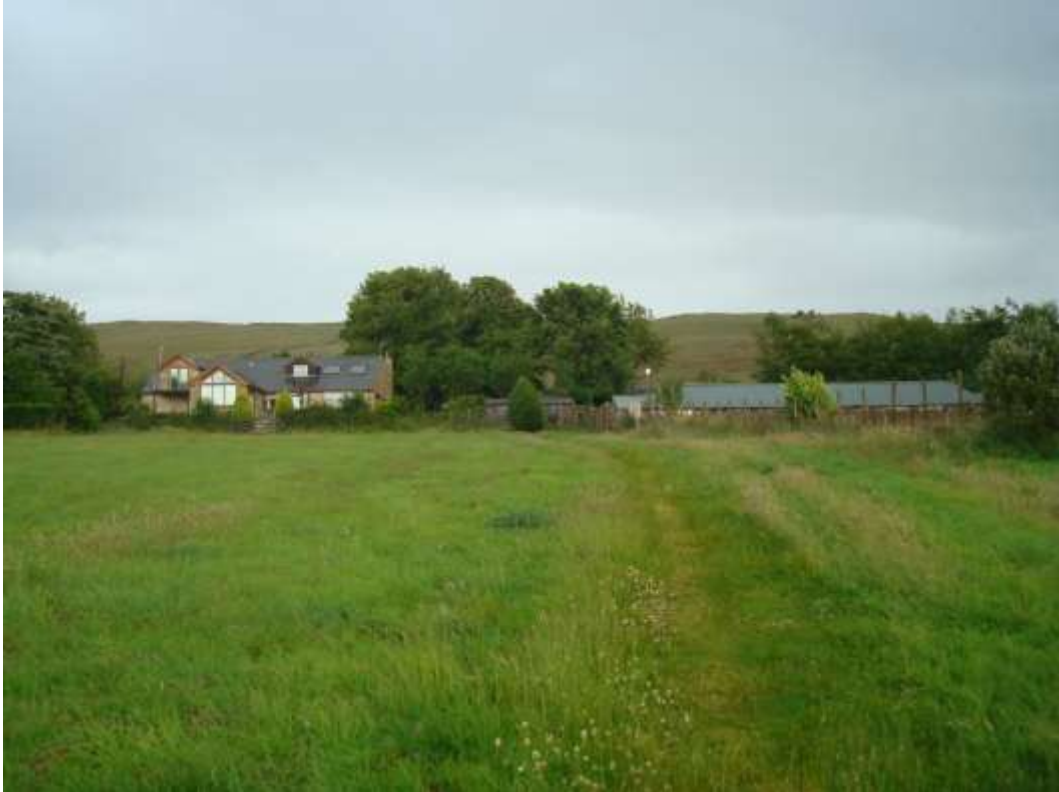
Photograph 5 – View looking south east from rear of site towards house and kennels with fence on development boundary in front.