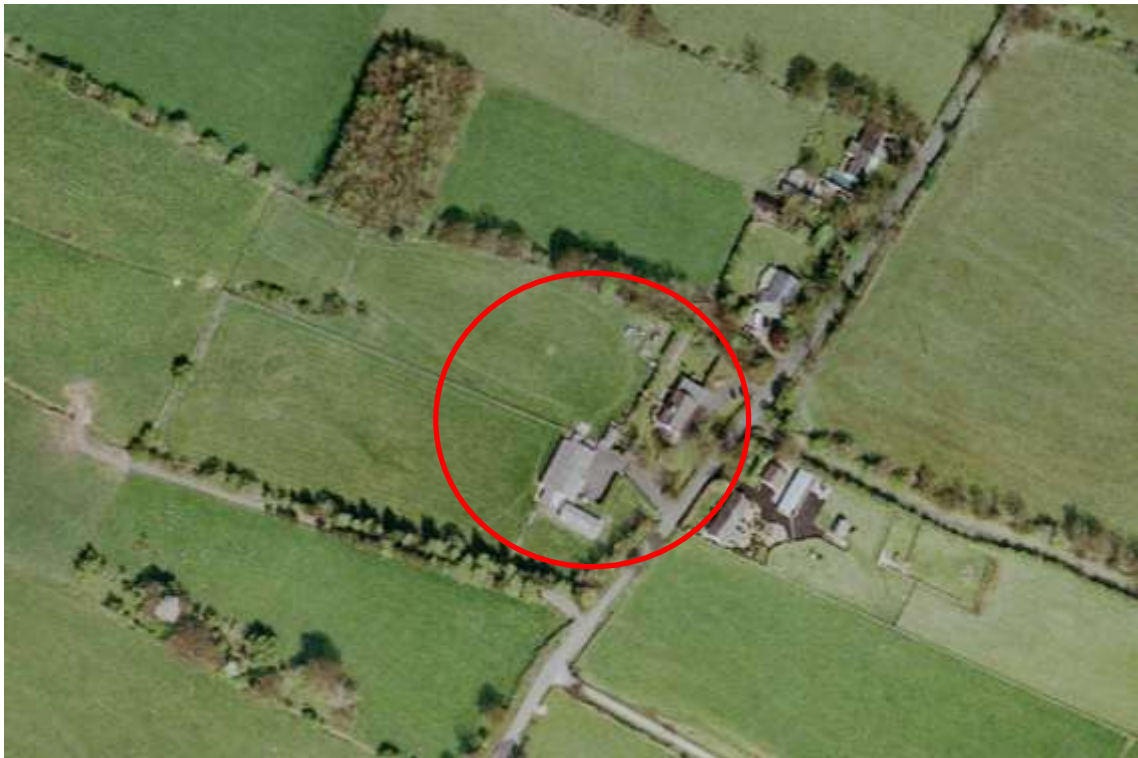
Figure 1 –Aerial view of the site in relation to the adjacent properties