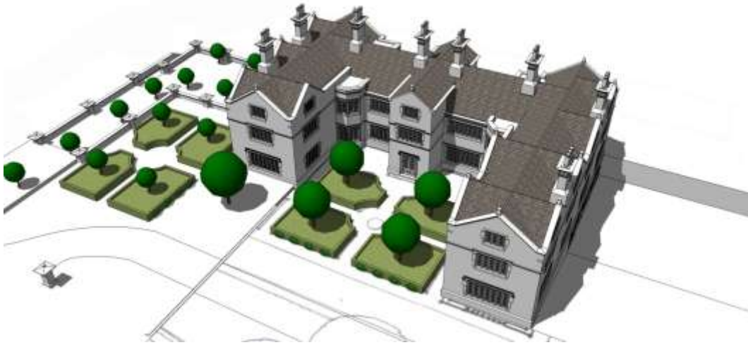
Figure 5 – Proposed aerial view showing formal planting, (note: the wings are now of equal length, the shorter wing.)