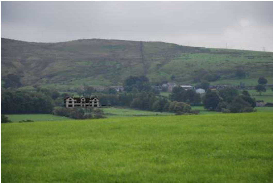
Photomontage 2 (See key plan on next page for viewpoint locations)