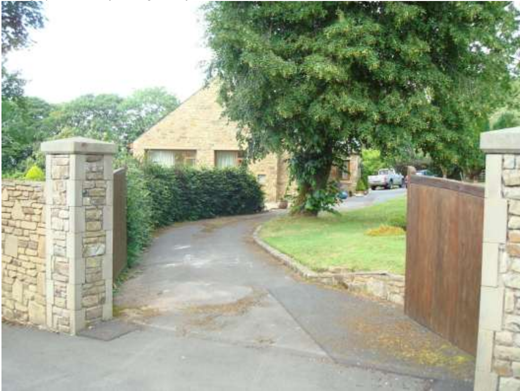
Photograph 3 – View of existing house looking north east from kennel driveway.