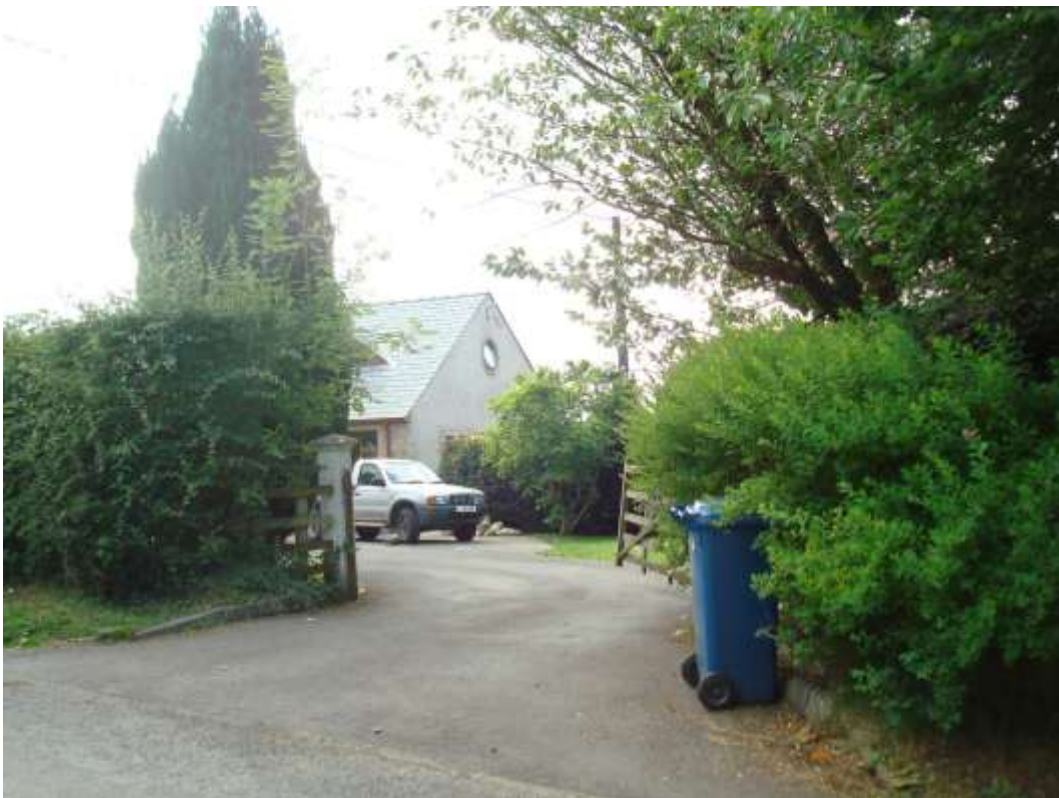
Photograph 4 – View of existing house looking west from house driveway.