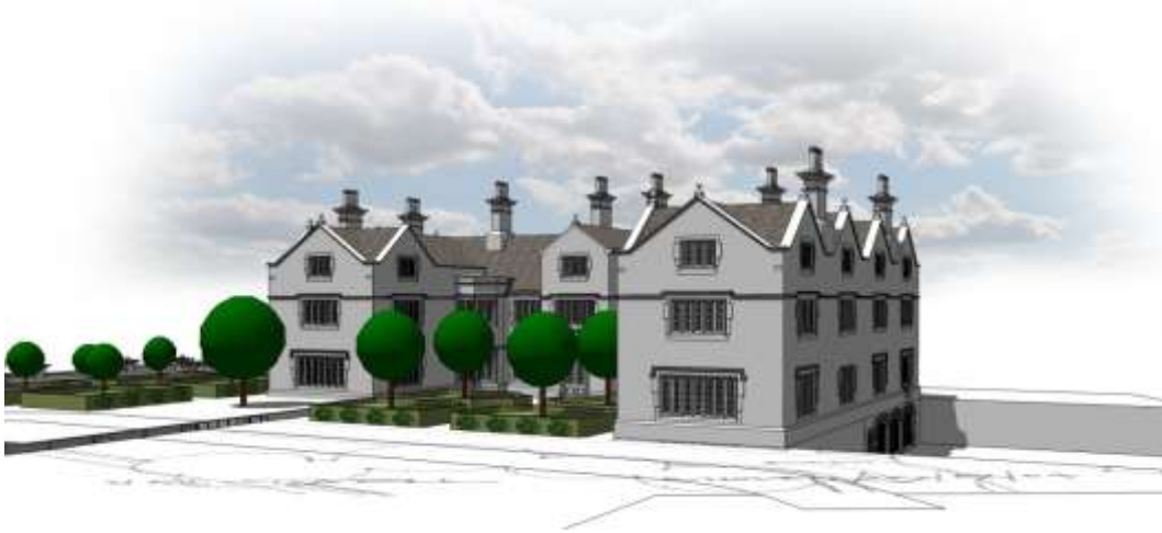
Figure 4 – Proposed view from Pendleton Road, (note: the wings are now of equal length, the shorter wing.)