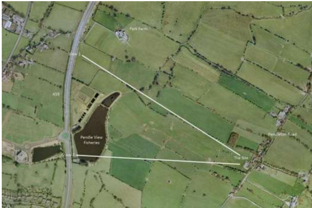
Figure 6 – Key to viewpoints for photomontages