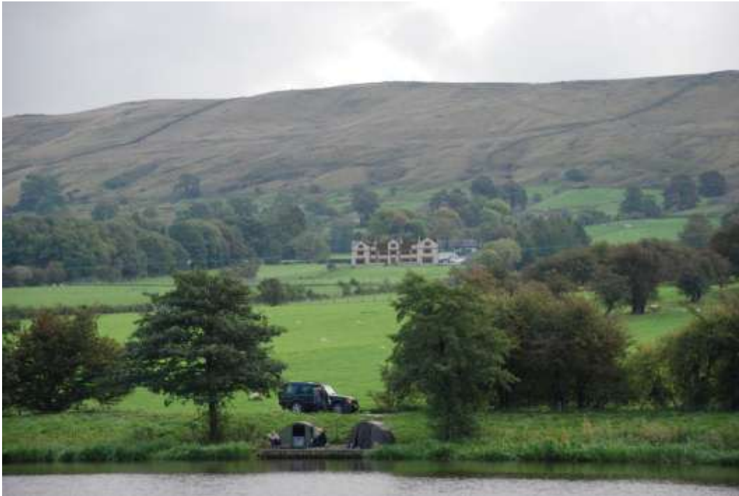
Photomontage 1 (See key plan on next page for viewpoint locations)