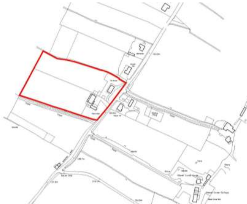
Figure 2 - Site Location Plan