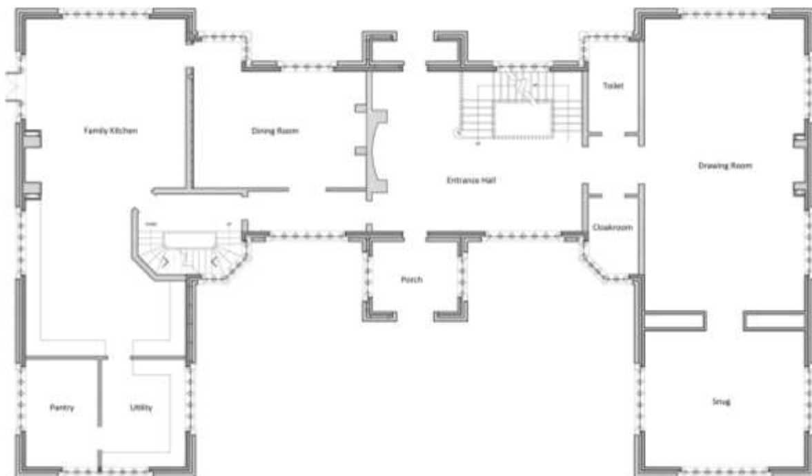
Figure 3 – 'E' shaped plan form, with equally dimensioned wings.