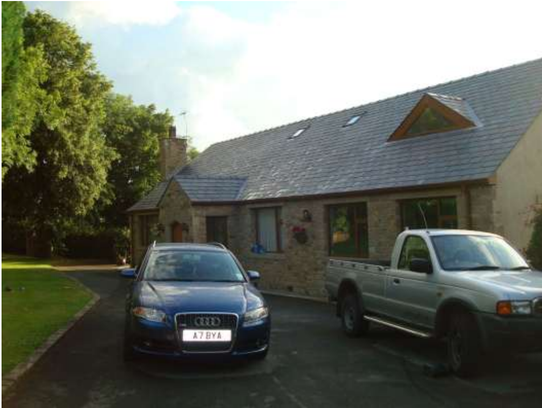
Photograph 1 – View of existing house from the south east.