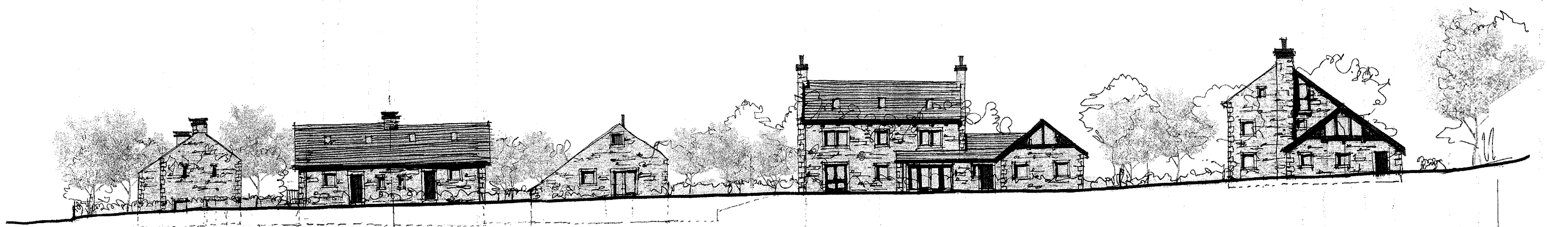
North Elevation (street scene)