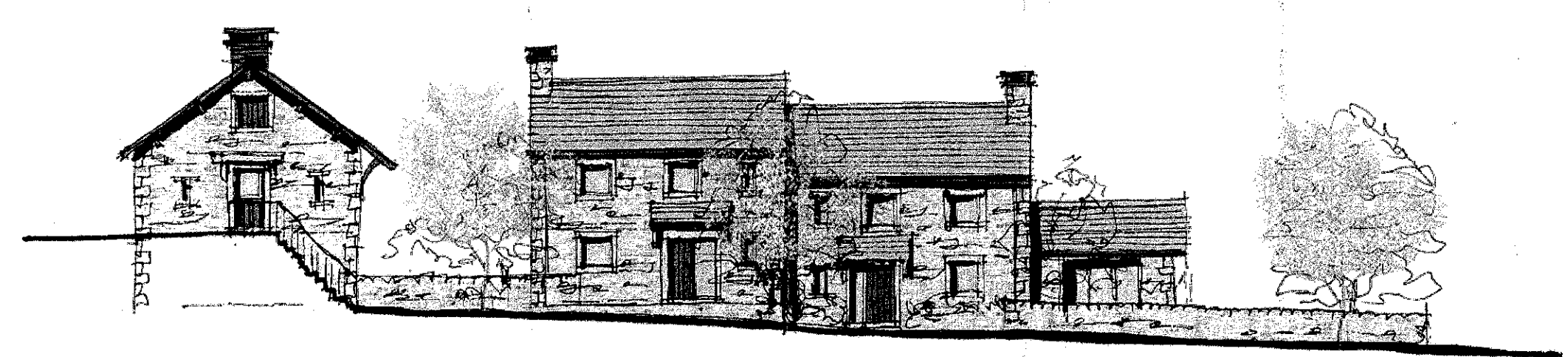
West Elevation (street scene)