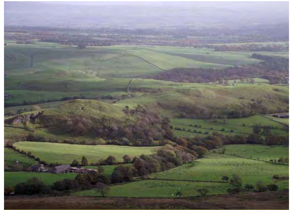
Little Bowland Knoll Reefs, Tunstall

glacial meltwater. One such complex, in the Ribble and Hodder valleys at Stonyhurst and Hurst Green, imparts a special quality of small wooded knolls to the local landscape. To the east of Gisburn, a tract of drumlins forms a characteristic landscape.