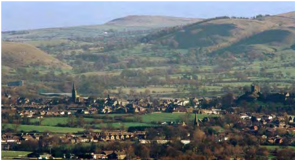
View across Clitheroe