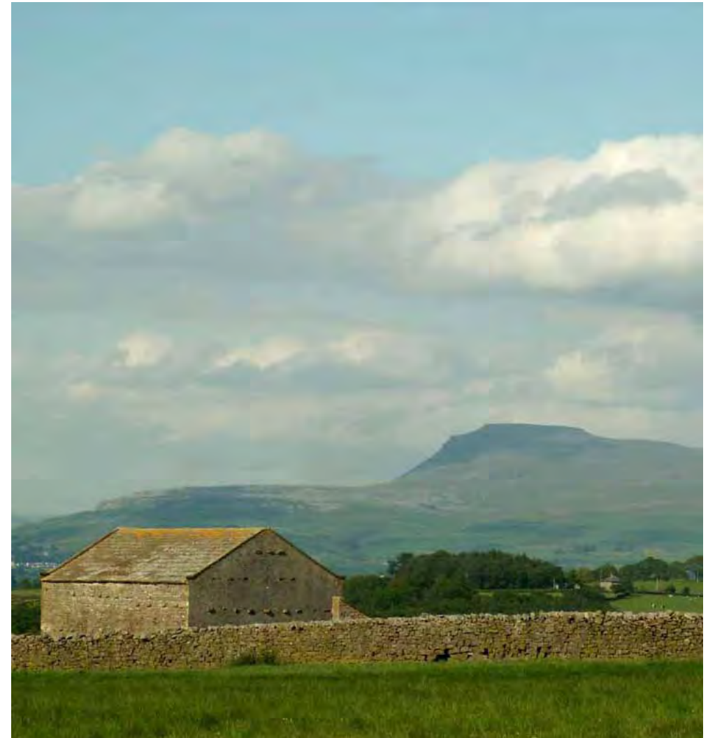
Barn at Overhouses, Ingleborough can be seen in the background in the adjacent Yorkshire Dales NCA

The textile industry developed from the 15th century, and farmsteads and settlements retain significant evidence of loom shops, with large windows dating from the 17th century. Industry is also represented by some small mill settlements in the Calder Vale, Oakencloough, Dolphinholme and Galgate (terraced cottages associated with mills), and by lead-mining remains and derelict lime kilns along the Ribble Valley. Settlement expansion dating from the 19th and 20th centuries is generally restricted to the south and south-east (Clitheroe and Longridge). Modern development around village fringes gives a suburban character, with a mix of building materials and styles.