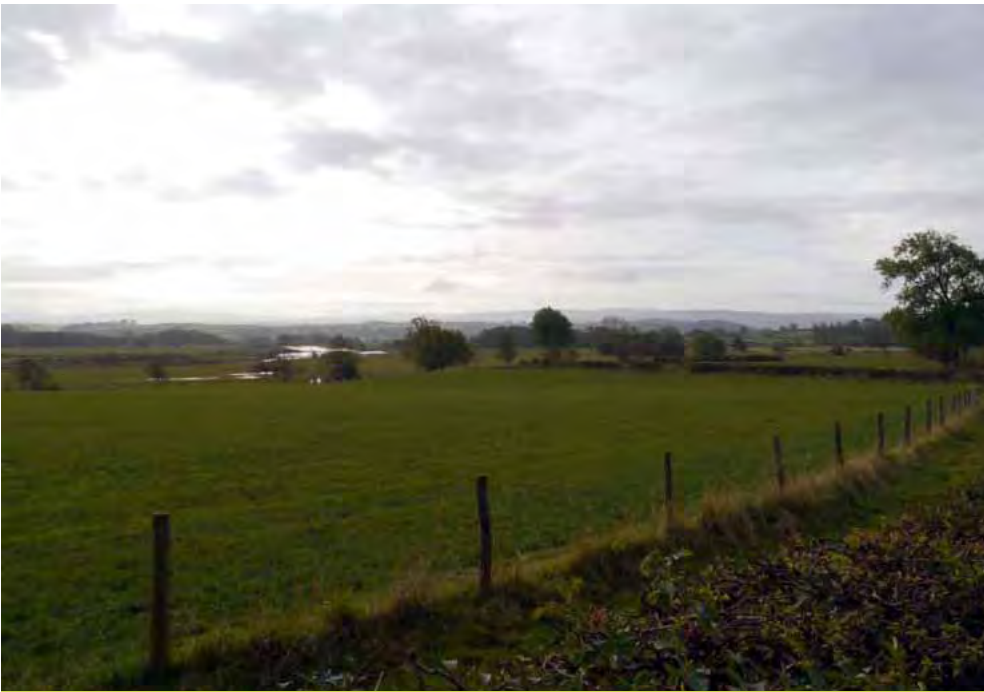
Lune Valley view, the Bowland Fells can be seen in the background

Bowland Fringe and Pendle Hill is a transitional landscape which wraps around the dramatic upland core of the Bowland Fells. It extends from the Lune Valley in the north, around the slopes of the Bowland massif, before merging imperceptibly eastwards into the landscape of the Ribble Valley. The eastern boundary links with the Yorkshire Dales, while the Lancashire Valleys lie to the south.