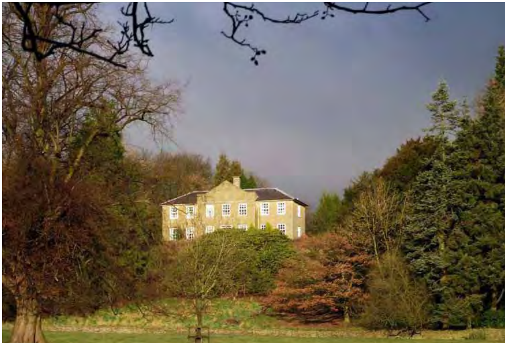
Large country houses and halls set in parkland, such as Leagram Hall, are a particular feature of the area

The Lune Valley has been used as a communication route since the Roman period – and even earlier. It formed a principal route for the Anglian invasion of Lancashire from the east from 570 AD, and for Norse settlers from the Isle of Man, Scotland and Northern Ireland from the early 10th century. The lush pasture and arable land in the Lune Valley has long supported prosperous farms – from the medieval period and earlier – and this is reflected in the number of large farms and country estates that are scattered along the valley sides. The Ribble Valley formed an important Roman communication route to York, and some evidence of Roman roads can still be found.