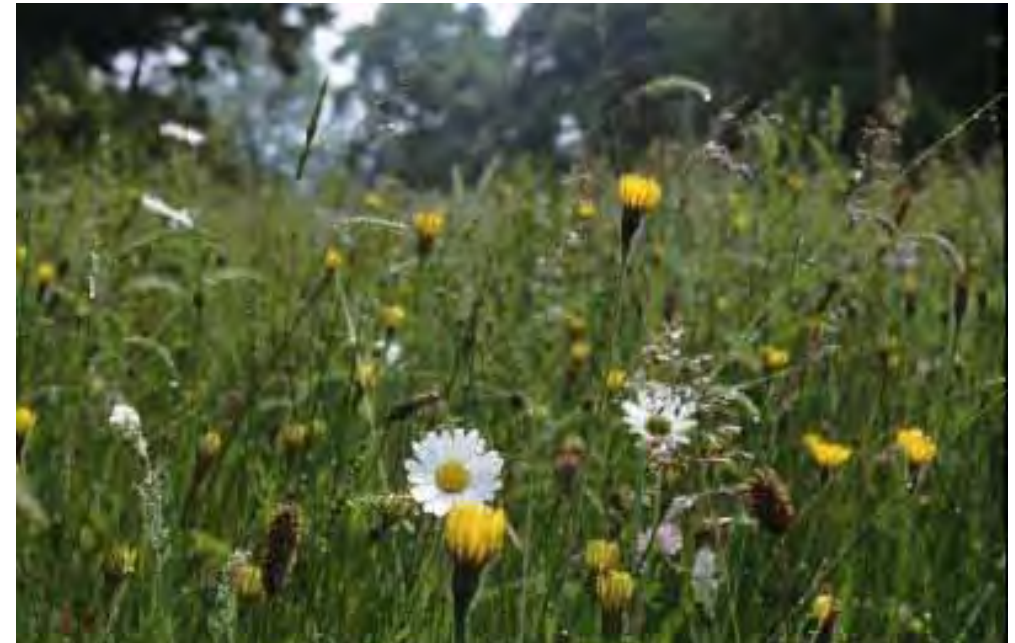
Clear Beck hay meadow

The Bowland Fells form a dramatic backdrop to many views within this NCA, and the moorland outliers of Beacon Fell, Longridge Fell and Pendle Hill afford long-distance views across the Lancashire plains and valleys towards the Irish Sea.