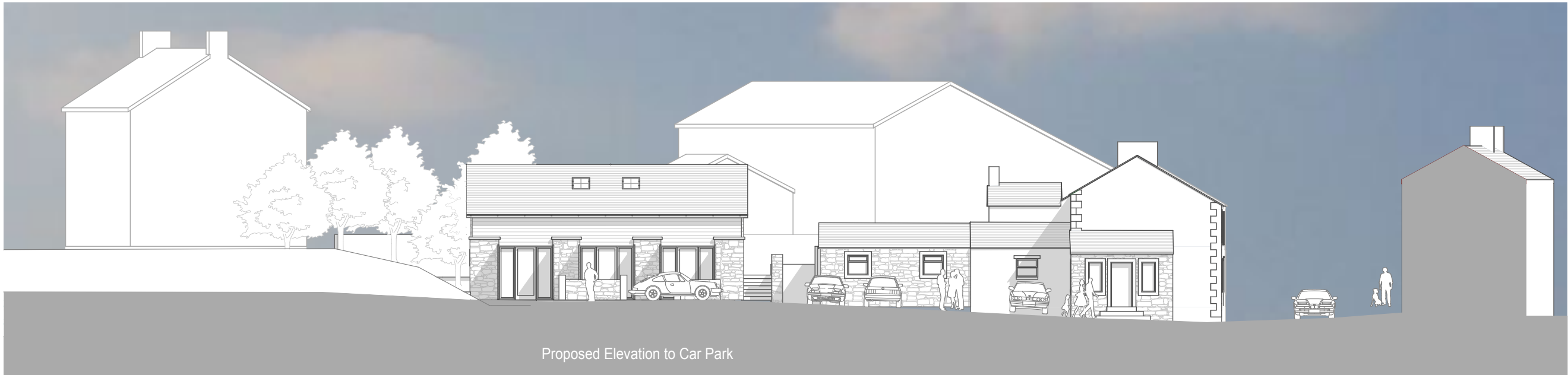
Proposed Elevation to Car Park