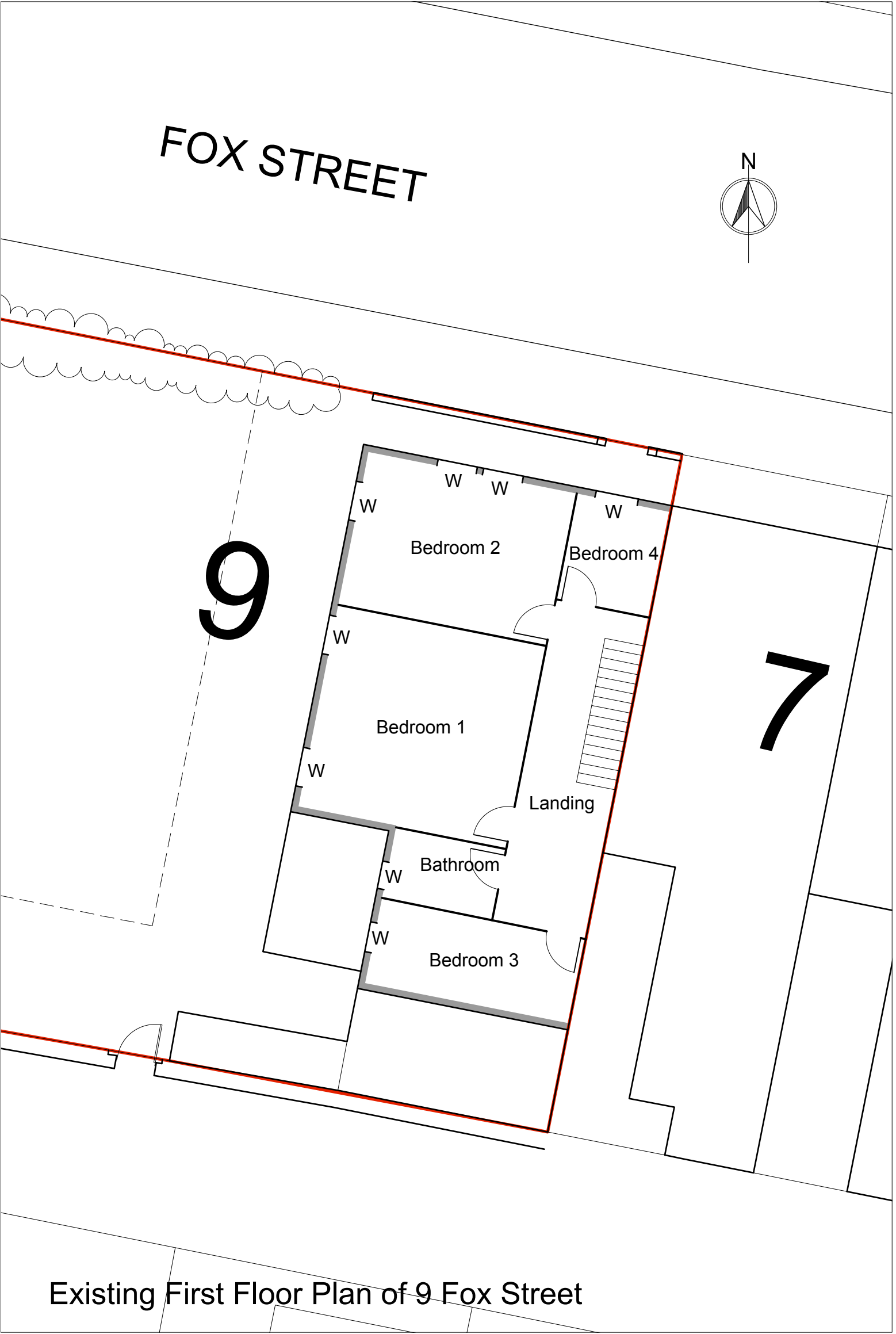
Existing First Floor Plan of 9 Fox Street

This drawing is the property of IWA Architects. Copyright is reserved by them and the drawing is issued on condition that it is not copied either wholly or in part without the consent in writing of IWA Architects. Dimensions should not be scaled. All dimensions to be checked on site by the contractor before commencement of the relevant part of the work