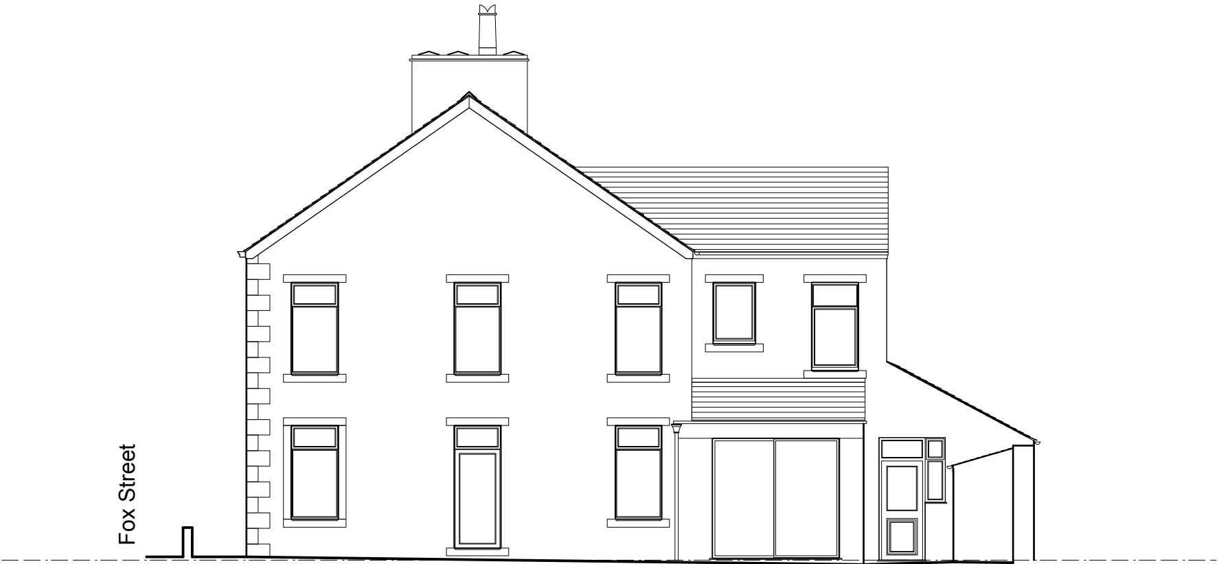
Existing Side (West) Elevation to 9 Fox Street