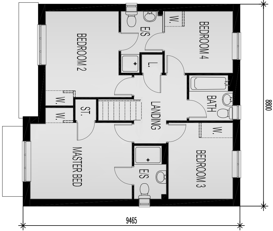
first floor plan