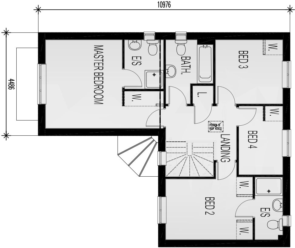
first floor plan