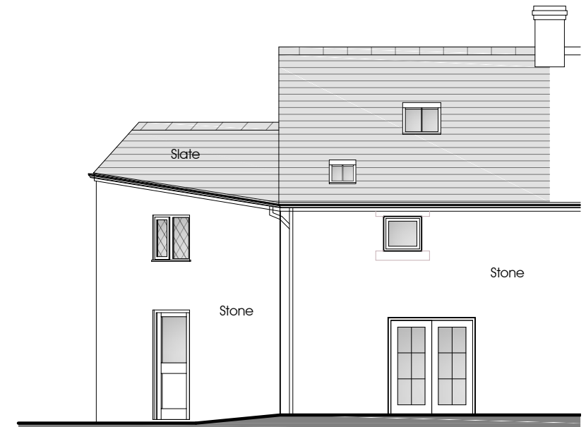
North east elevation

Rev B 18-10-2014 To signify latest planning app