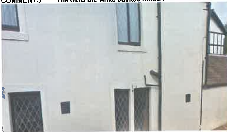
Wall adjacent to Fell road

COMMENTS: The walls are white painted render.