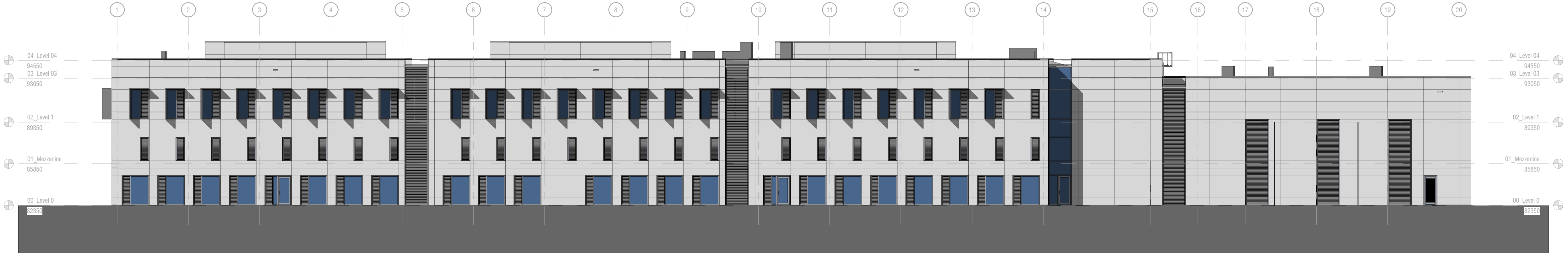
South 1 : 200