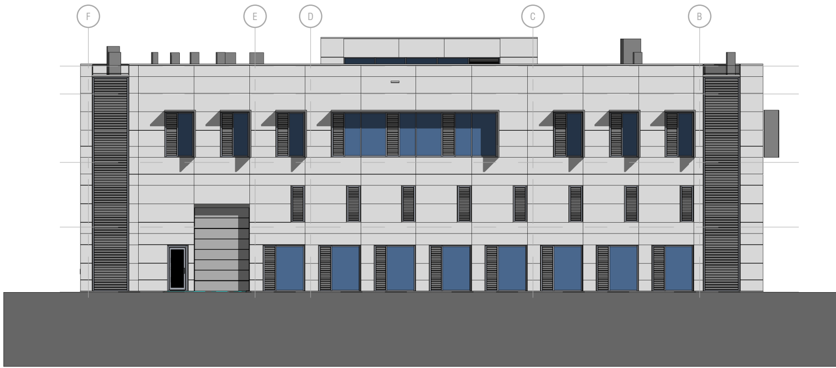
West 1 : 200