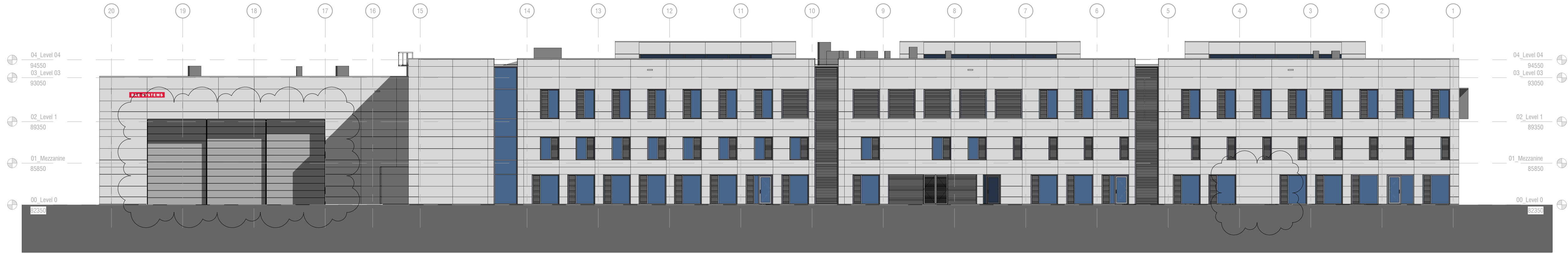
North 1 : 200