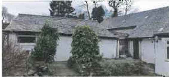
Part rear cottage and north elevation of workshops