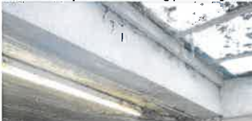
Link roof glazed.