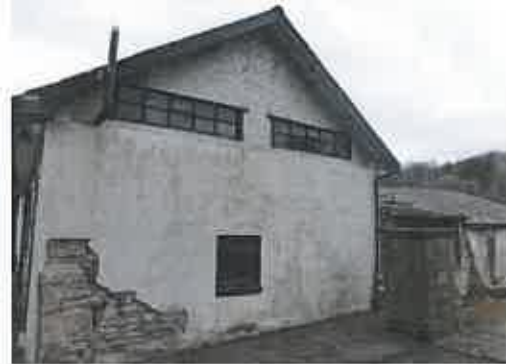
South elevation main workshop