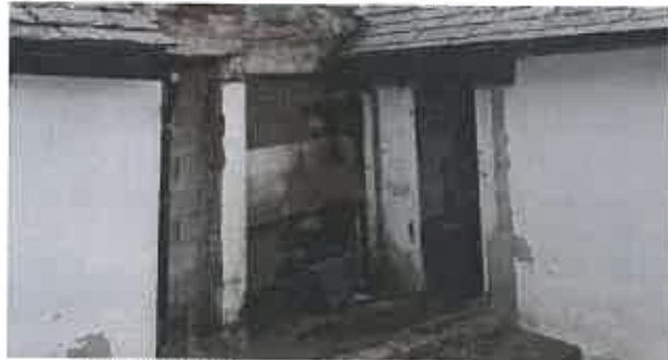
Rear workshop walls.