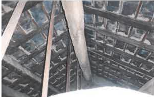
Cottage roof void