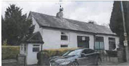
West elevation (front)

The building is a two storey cottage with workshops attached to the side and a further single storey work unit extending to the rear in an easterly direction which is connected to the main building with a single storey. The building probably dates from the 19 C. It is currently uninhabited and the workshops disused.