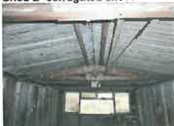
Shed 2- internal