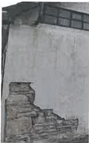
Workshop gable wall showing stone render and Painted brick.