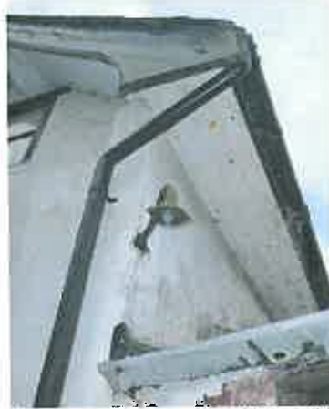
Workshop gable and soffit (south)

SHEDS: All the sheds have conventional pitched roofs.