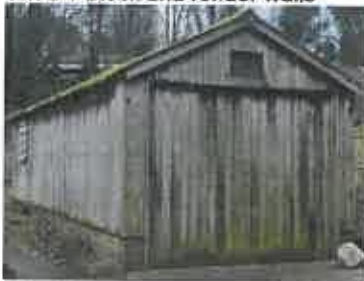
Shed 4 timber and brick plinth