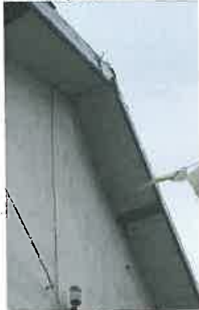
Cottage gable (north)