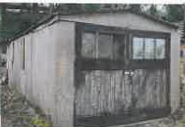
Shed 2 Pre cast conc