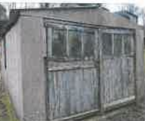
Shed 3 Pre cast conc