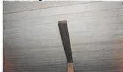
Boarding to the u/s of workshop roof

SHEDS - The sheds were cold and draughty the construction did not provide any potential roosting or hibernation habitat for bats.