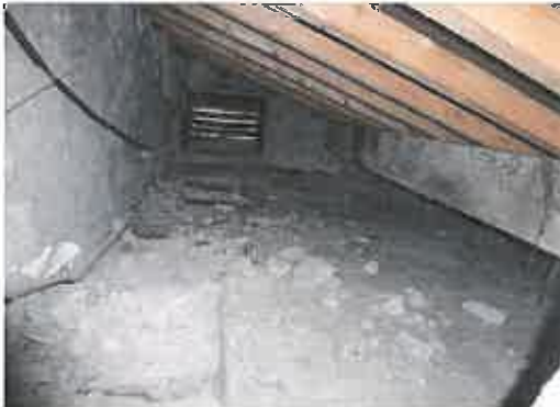
Rear workshop roof void showing potential grille access

COMMENTS: The cottage roof void was accessible via a ceiling hatch however it was not safe to enter. The slate is bedded on to the battens with mortar. The timbers are in good condition with no cracks or crevices the ceiling is covered with fine rubble and in generally dusty. It has low potential for supporting roosting bats. The roof space over the rear workshop was partially accessible, the rafters appear to be quite new and the ceiling was covered with mortar debris probably from when the original rafters where replaced. The space is draughty and although accessible there were no signs ie. Feeding or dropping evidence that bats have entered the space. The remainder of the workshop roof had boarding to the underside, any possible voids behind were not accessible.