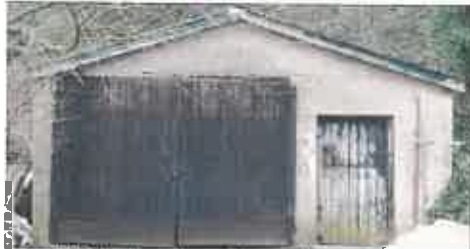
Shed 1 Block and render walls