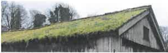
Shed 4- Dense moss over corrugated sheet.