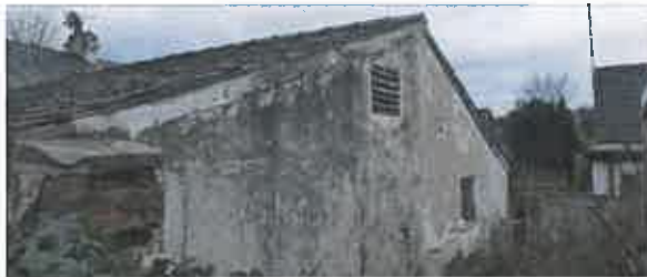
East elevation workshop