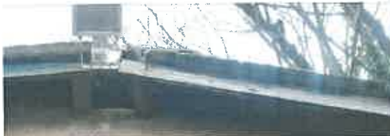
Shed 1- Corrugated fibre sheet over timber purlins

SHEDS: All the sheds have conventional pitched roofs.