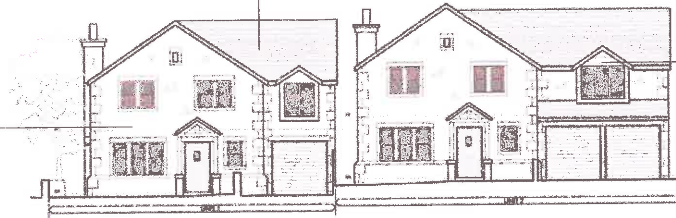
PROPOSED SOUTH WEST ELEVATION (FACING KNOWSLEY ROAD)