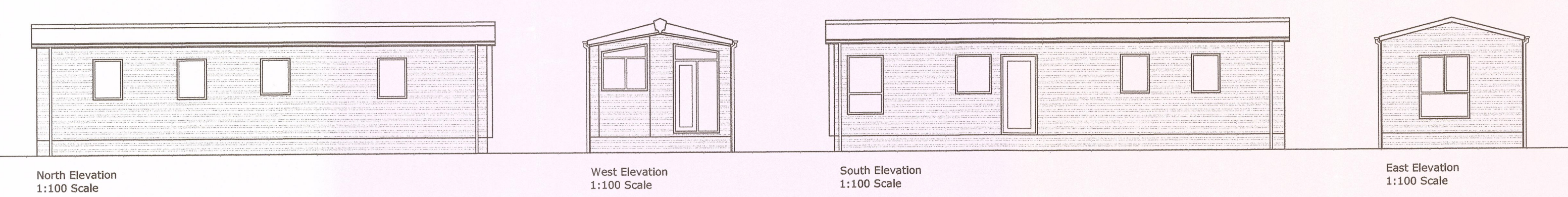
Caravan Elevations 1:100 Scale