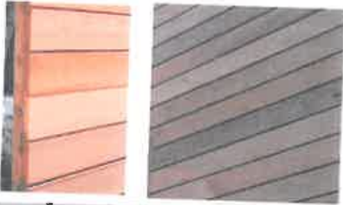
Horizontal cedar cladding