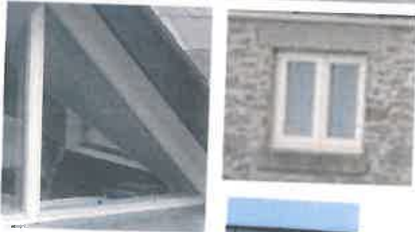
Hardwood timber windows, doors, soffit and fascia boards painted cream