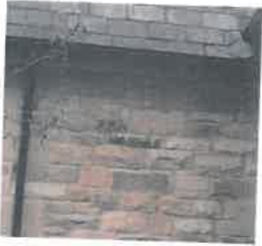
Natural random stone

Dunsop Bridge Trout Farm Proposed New Dwelling