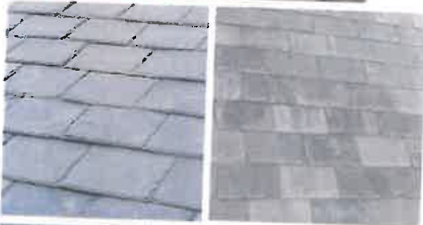
Reclaimed natural blue slate