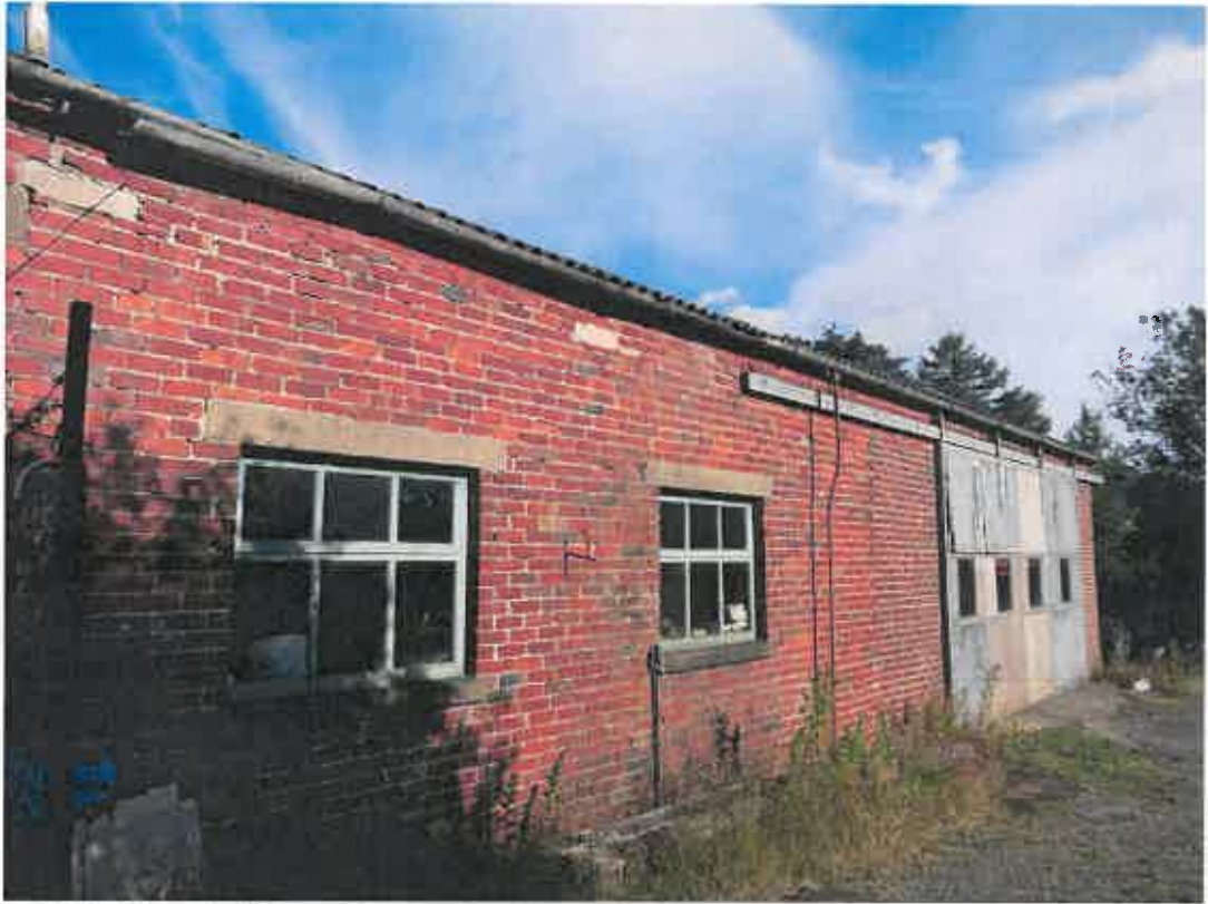
Brick built outbuilding with single skin roof