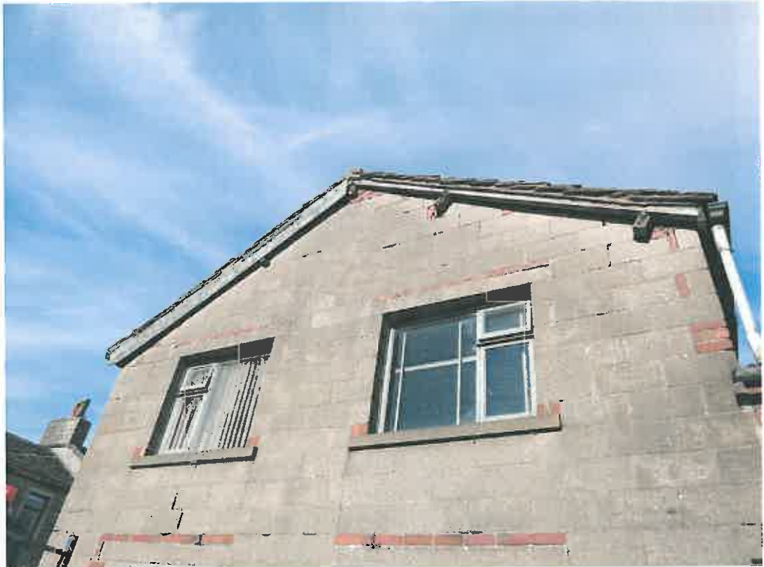
Barn western end