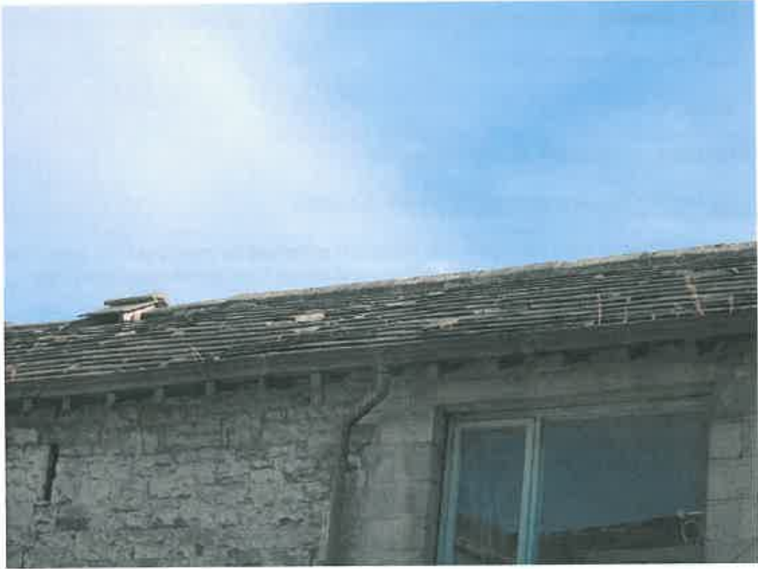
Roof of main barn