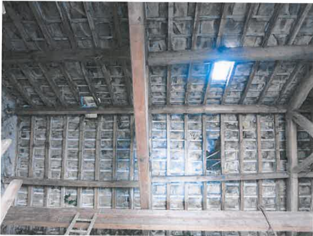
Roof of main barn

No suitable joints in barn joists were available to be utilised by bats.