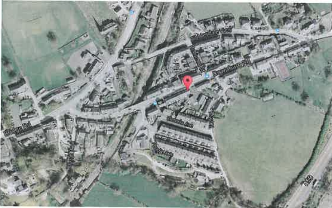
Aerial View showing surrounding habitat