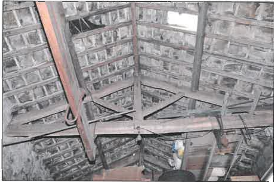
Former barn: underside of roof