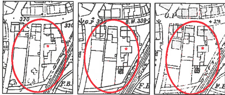
Figure 2: OS 1:2500 maps, published 1886, 1912 and 1932 4