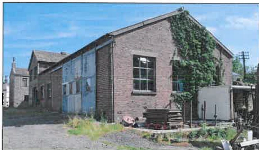
Mid 20th century workshop: south end