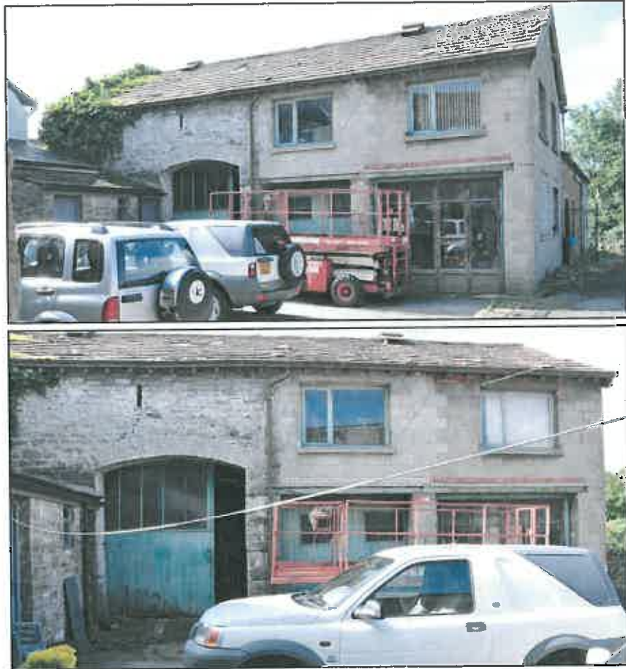
Former barn: north elevation