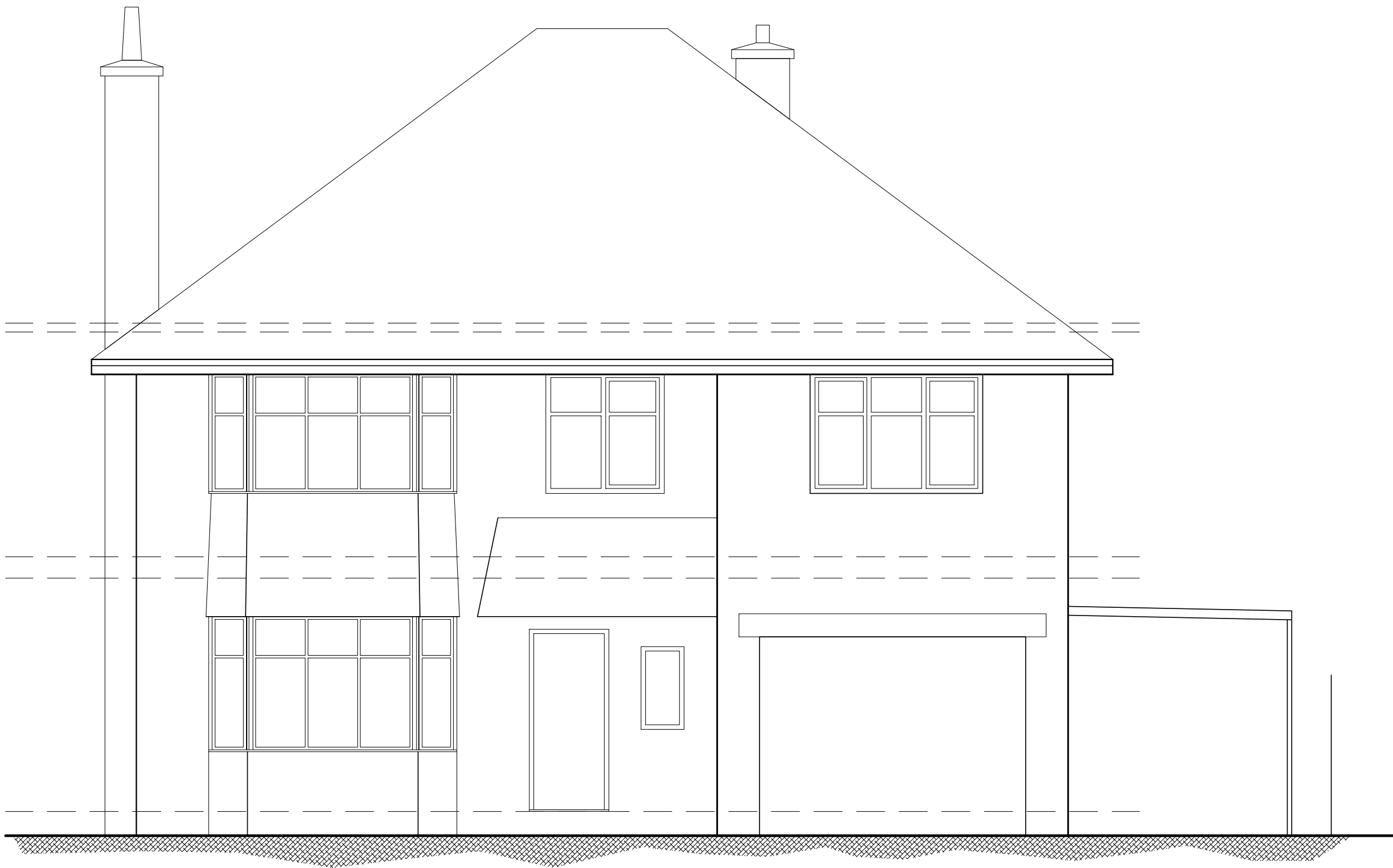
Front Elevation (West)