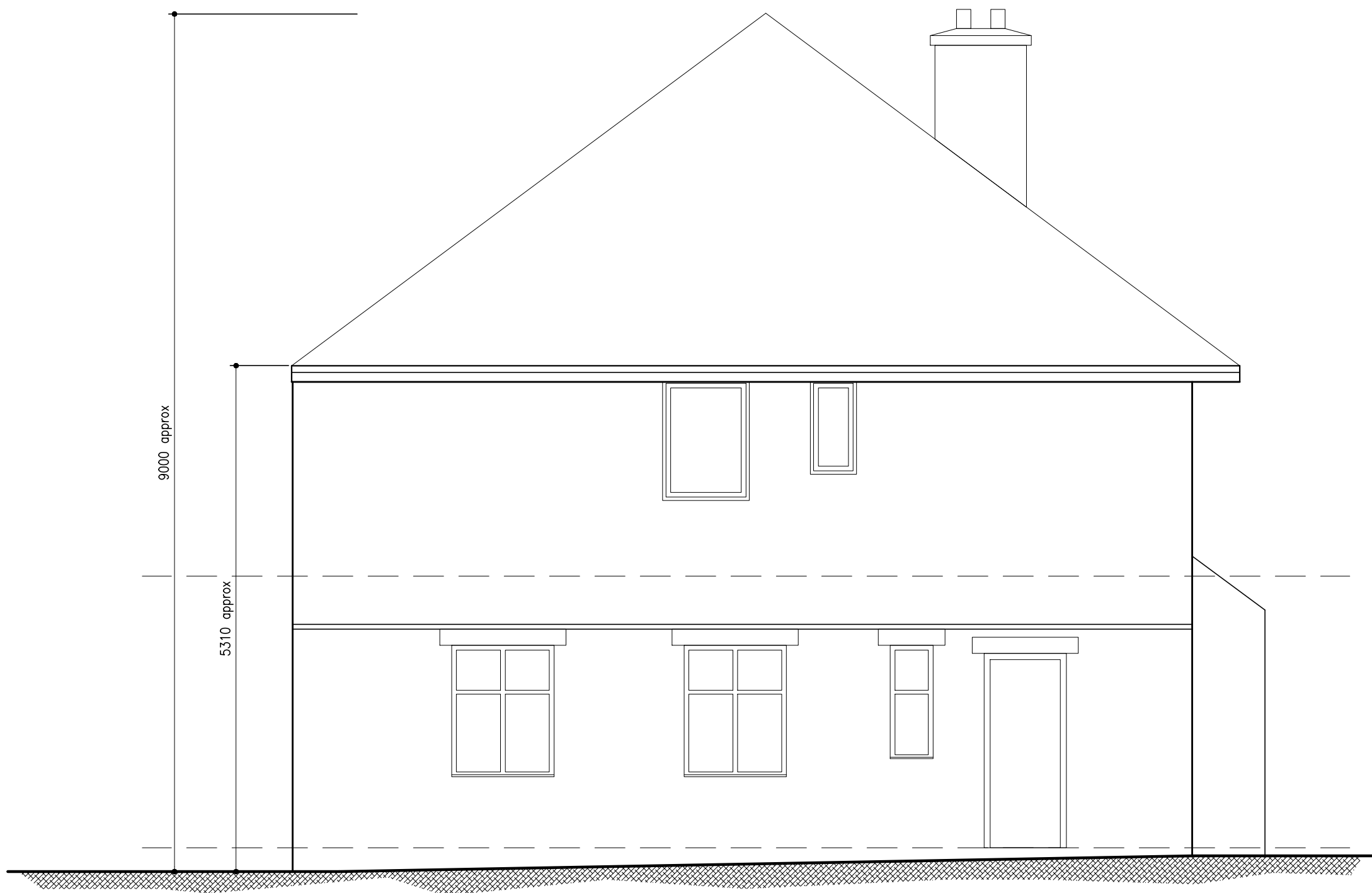
Side Elevation (South)