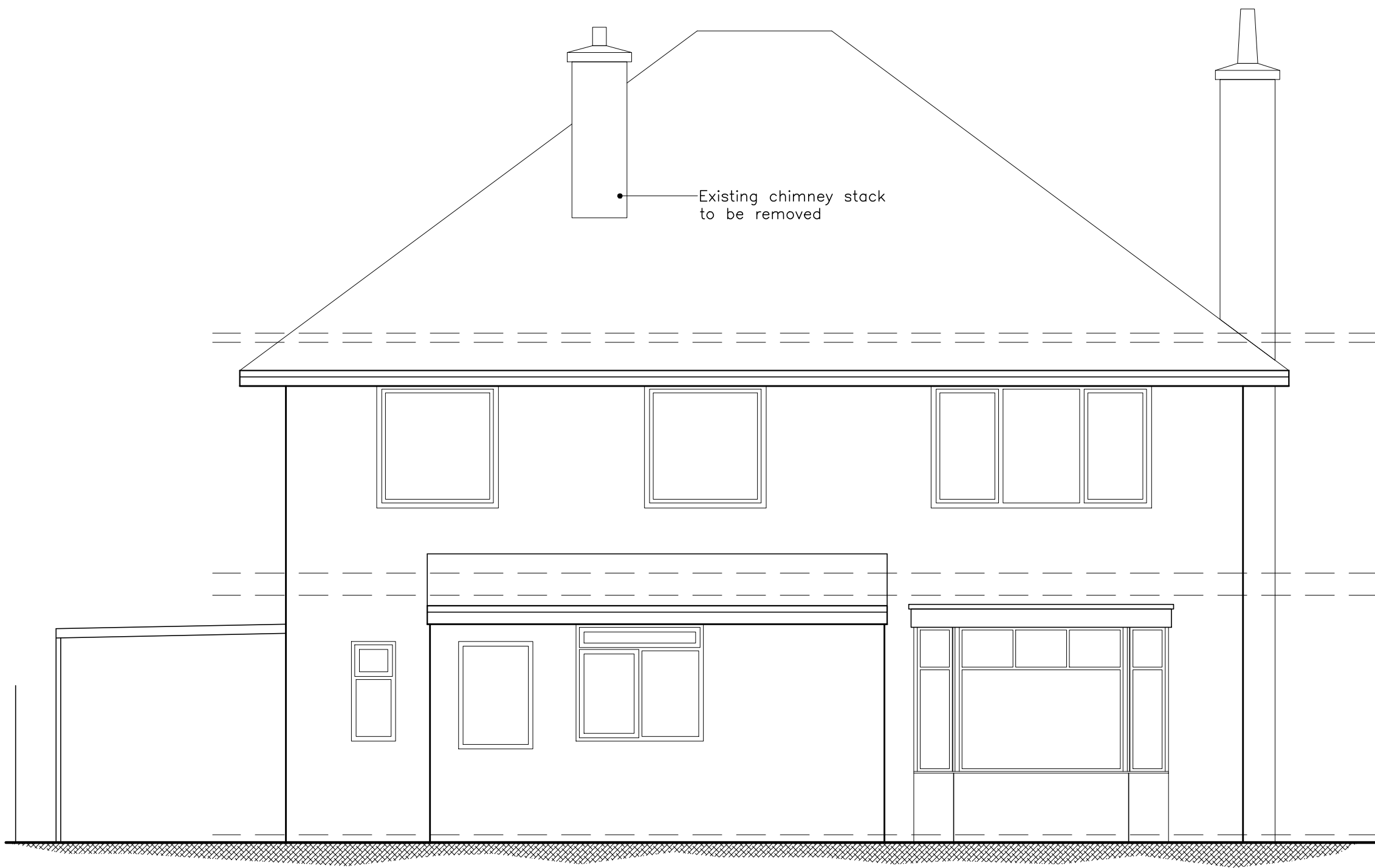
Rear Elevation (East)