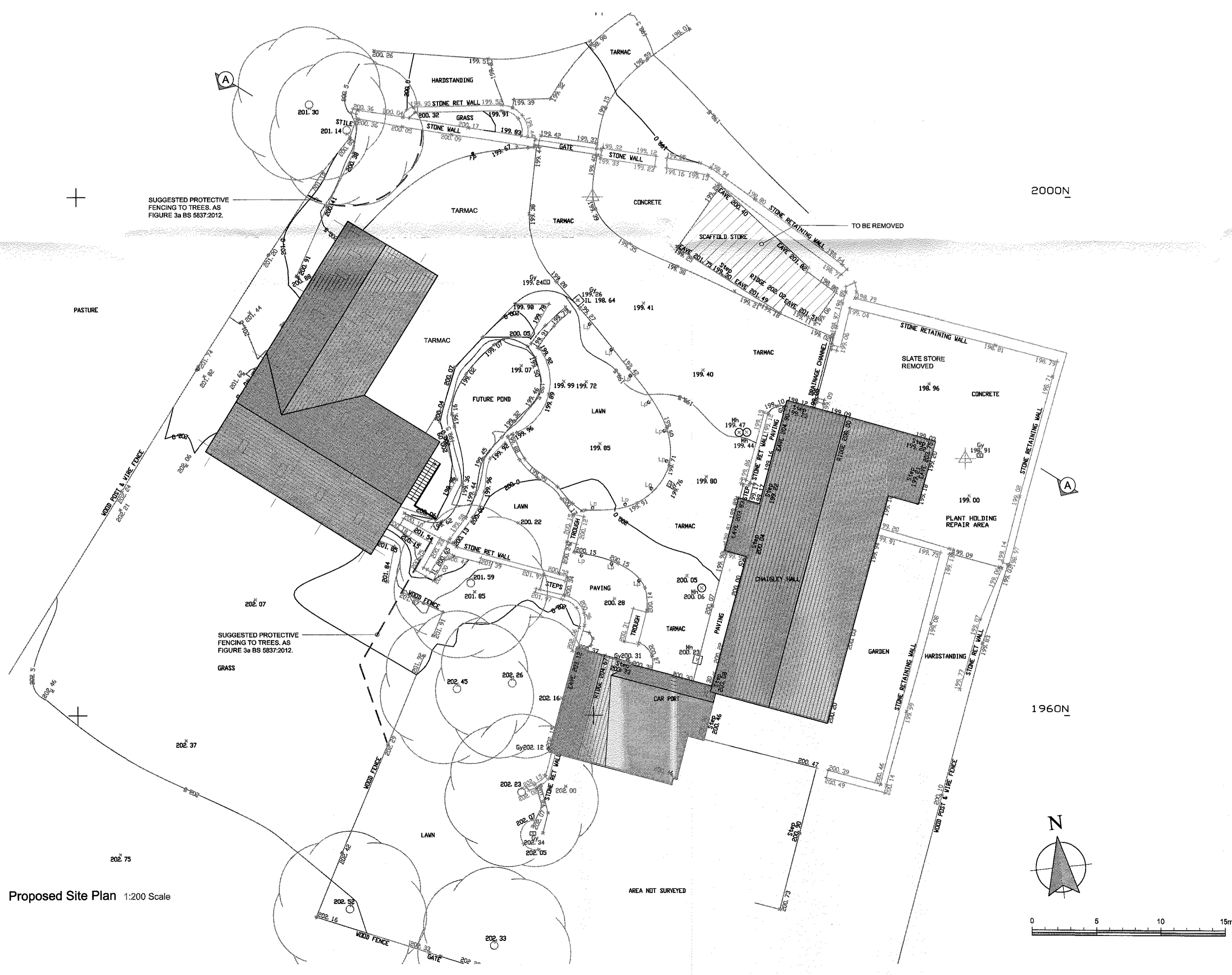
Proposed Site Plan 1:200 Scale

REVISIONS: Rev A - Various amendments after client meeting, including: Reduction of roof overhangs. Removal of exposed purlins. Amendments to rooflights/glass slips, ventilation slits. Building position shifted. -28.07.15 - NE