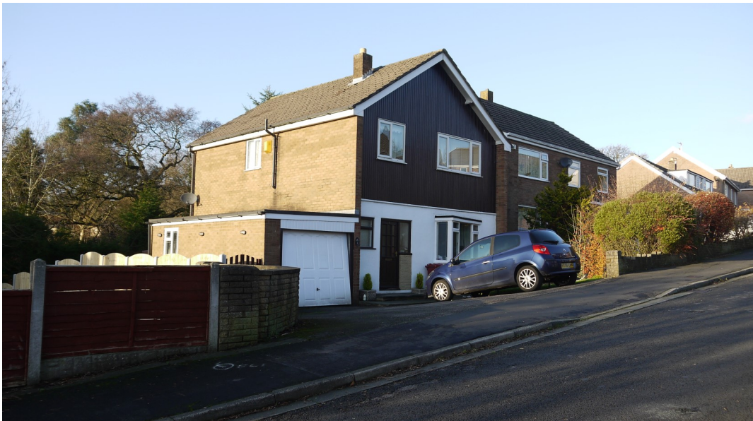
View looking toward the adjacent, No 2 Harewood, Avenue

Materials will be as stated on the submitted plans.