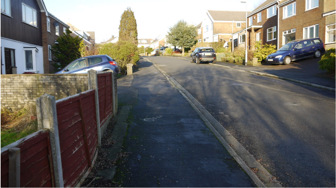
View looking north up Harewood Ave.