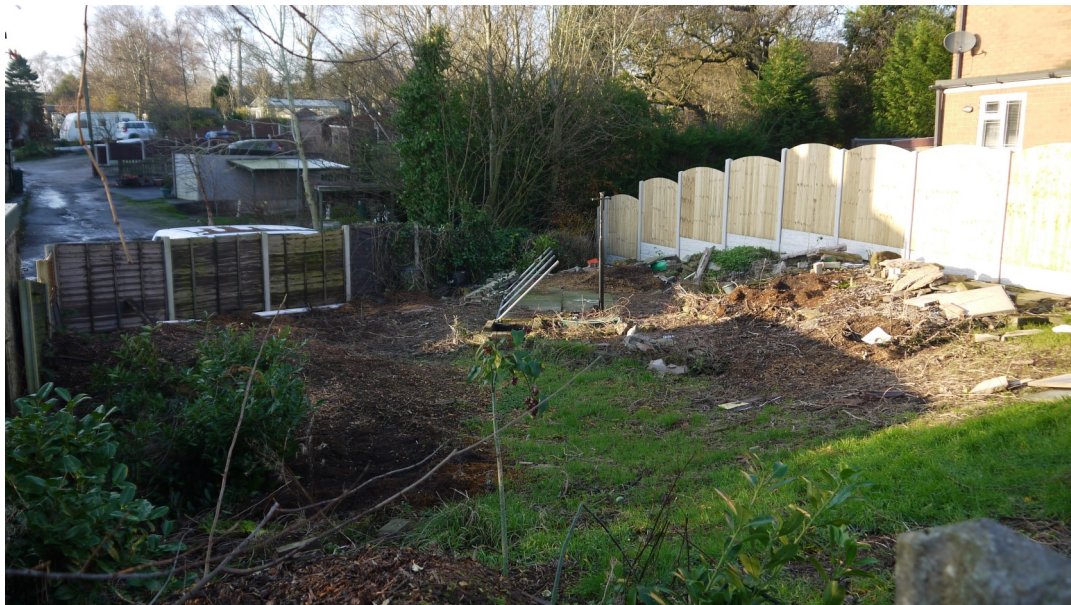
View looking west over the site

The subject site is situated off Harewood Ave., Simonstone, to the east of the site are the front gardens of Littleholme and Beacon Holm, detached houses on Harewood Avenue, to the south lies a section of land upon which a garage/store has been erected, to the west lies the rear street of a terraced row fronting Whalley Road, to the north is No 2 Harewood Ave.