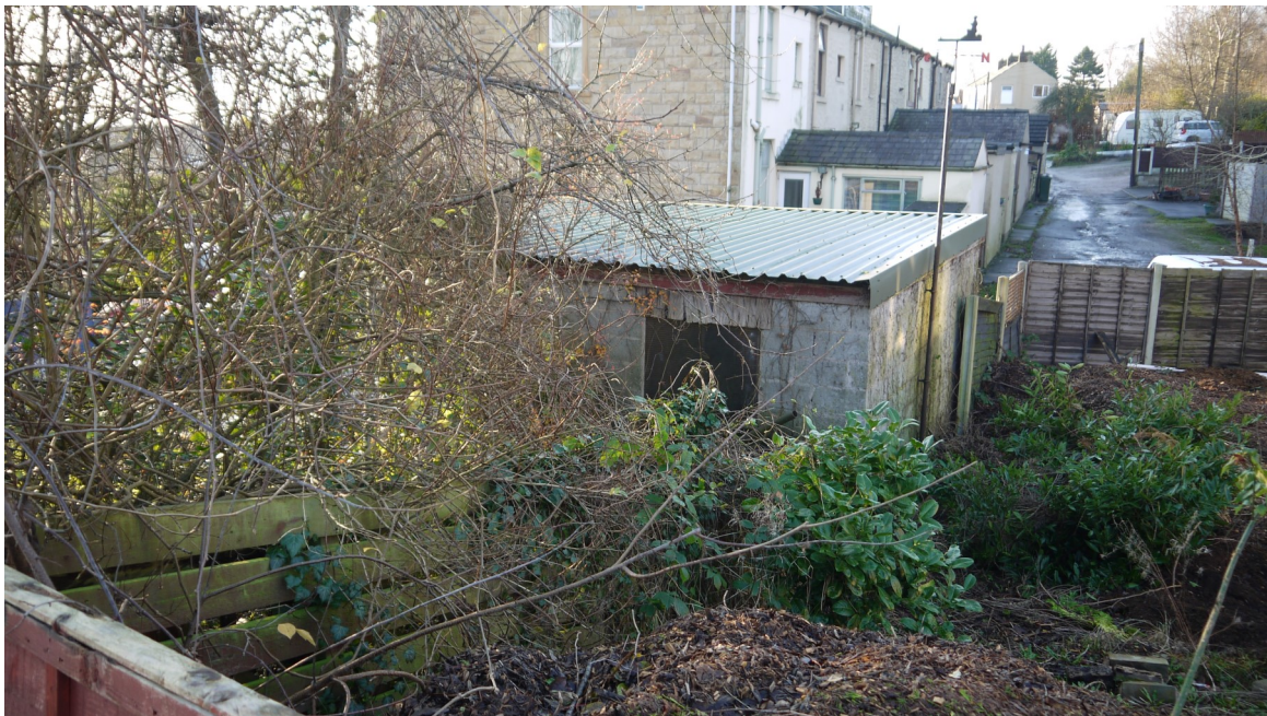
View over the site depicting garage/store over adjacent land

4.1 The Council's Supplementary Planning Guidance "Crime Reduction Through Environmental Design" has also been taken into account. A key factor is that the site is currently open to the access road and the surrounding dwellings offer considerable potential for surveillance. Its development will reduce the opportunity for crime. Windows, doors and locks will all be designed to meet "Secured by Design" standards.