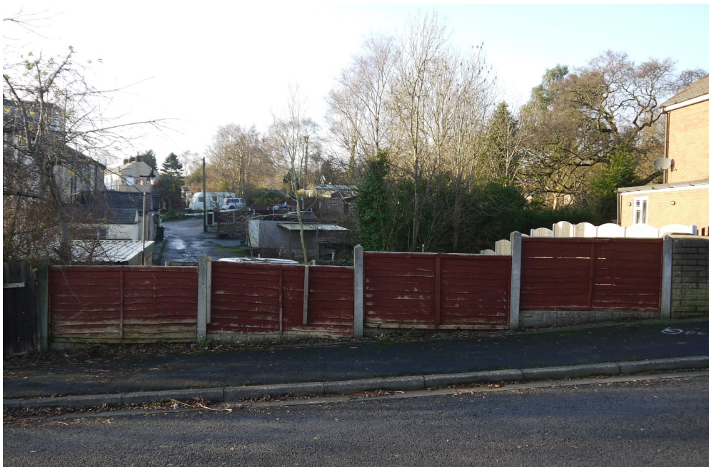
View looking west over Harewood Ave.

Shops, Doctors, and Dentists are all within 2 miles from the site.