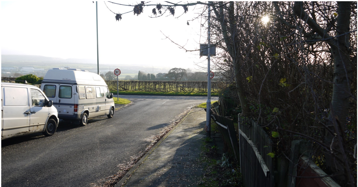
View looking south down Harewood Ave.