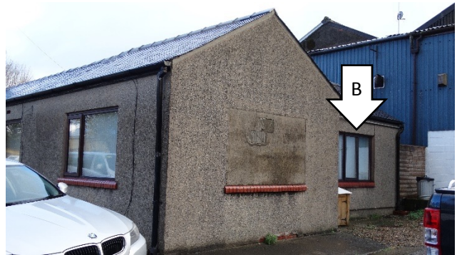
Figure 4: south elevation