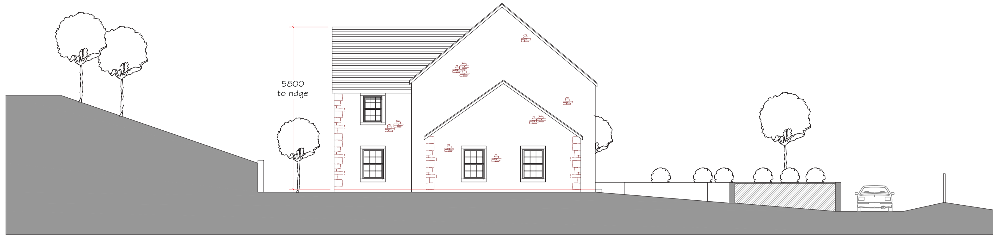
SOUTH WEST ELEVATION 1 : 100