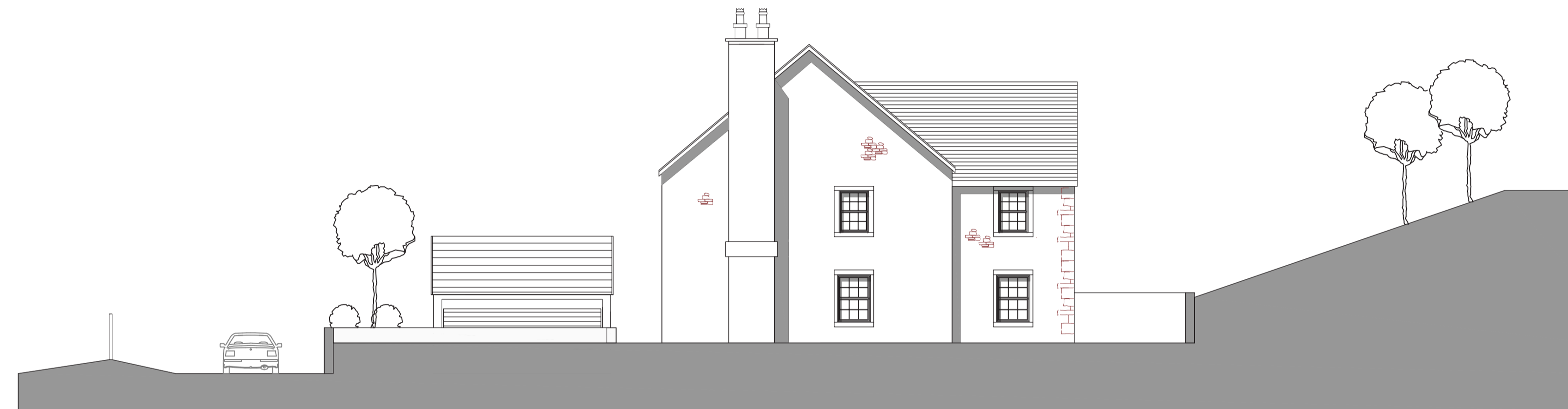
NORTH EAST ELEVATION 1 : 100