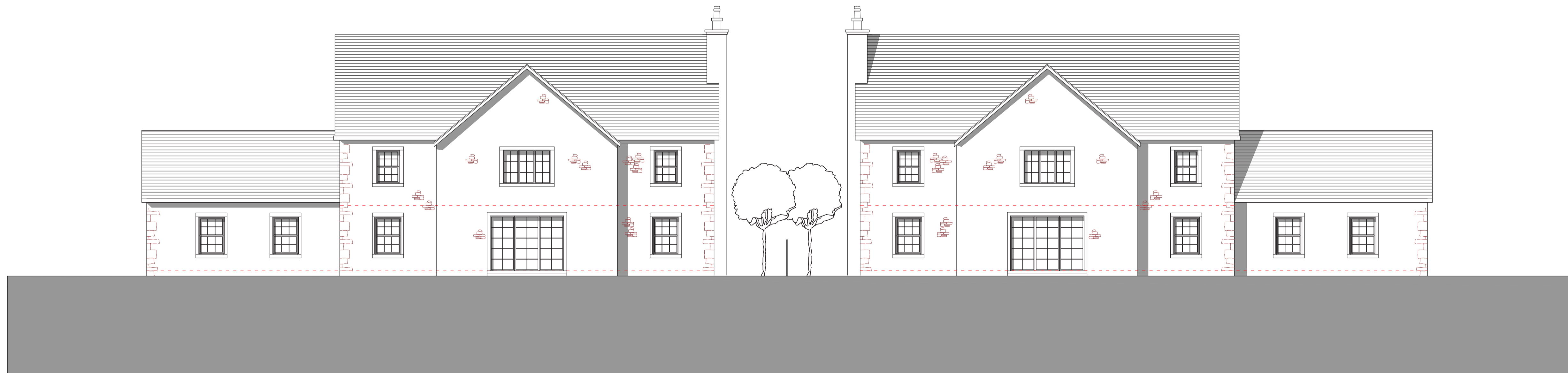
NORTH WEST ELEVATION 1:100