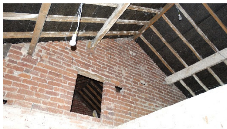
Figure 5: main roof