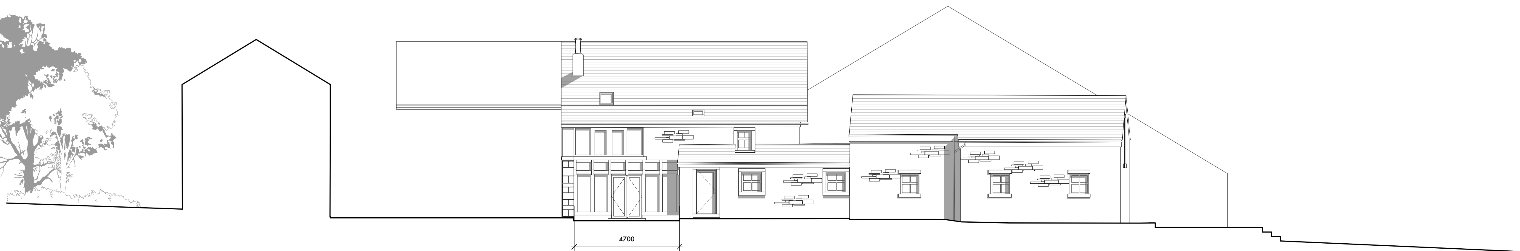
elevation 4 - north elevation