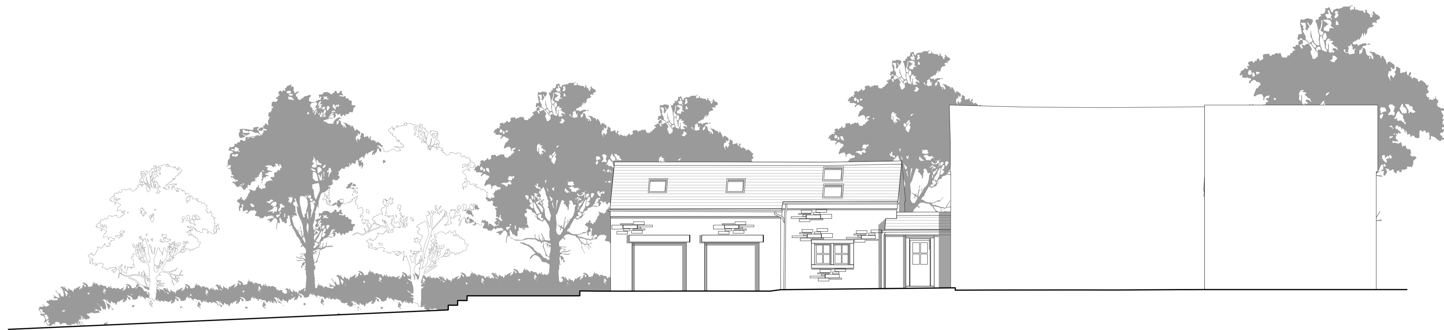
elevation 1 - south elevation