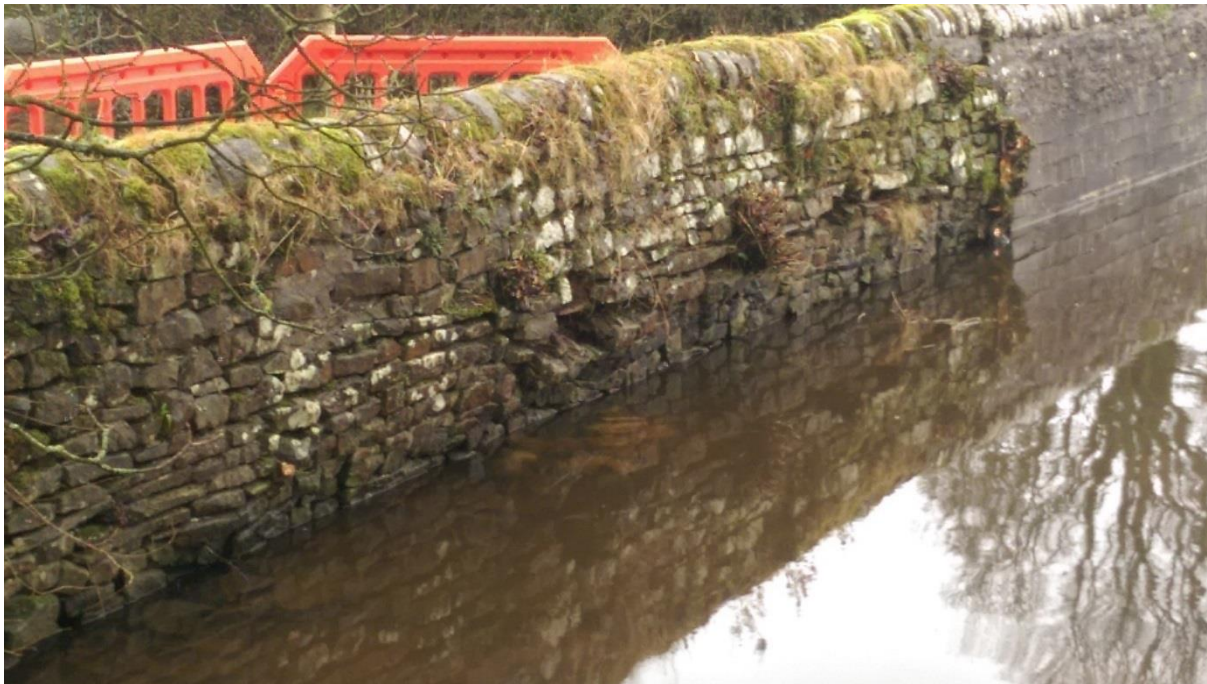
Photograph 4: Mill Pond Wall Deterioration – December 2015