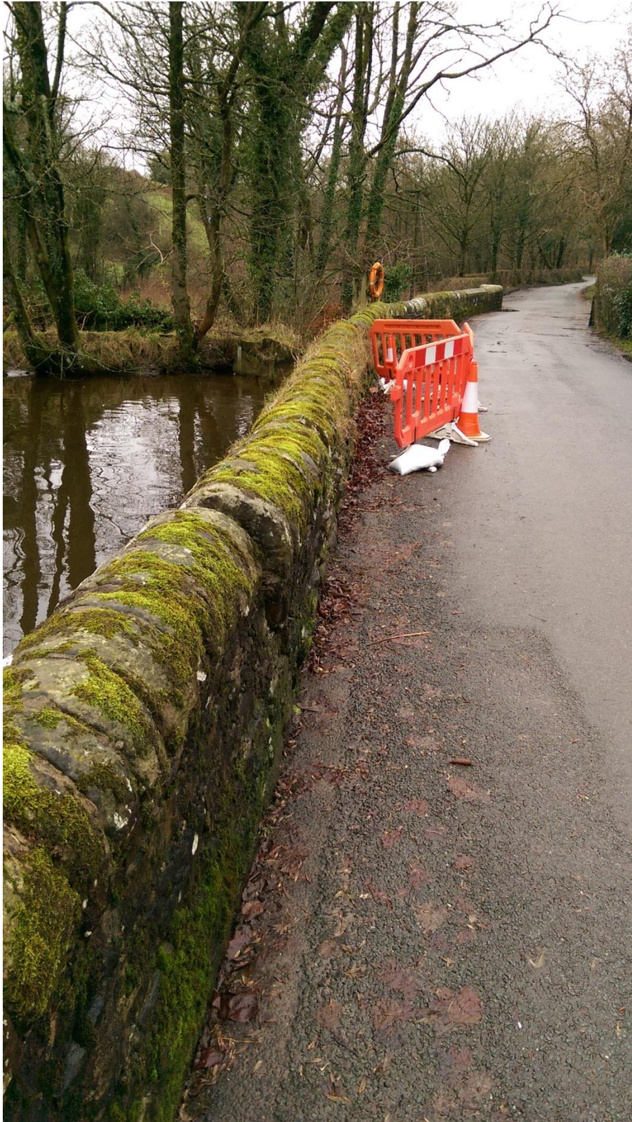
Photograph 1: Mill Pond Wall Deterioration – December 2015