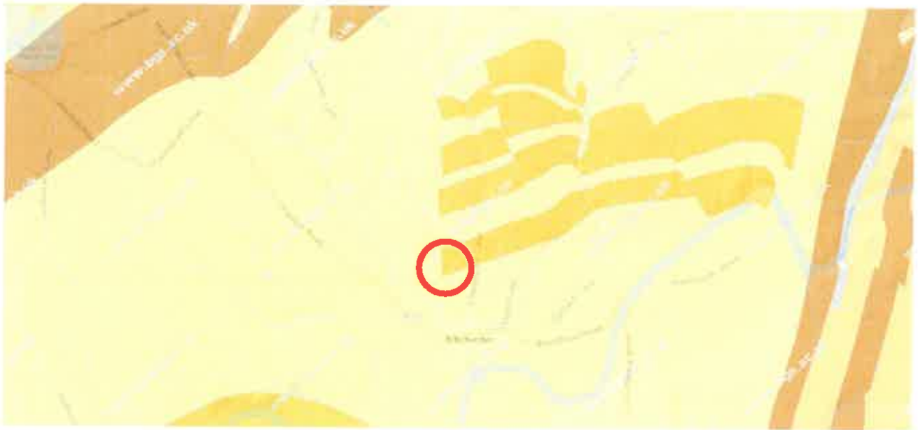
PL01: Extract of a British Geological Survey Map showing the location of the application site.