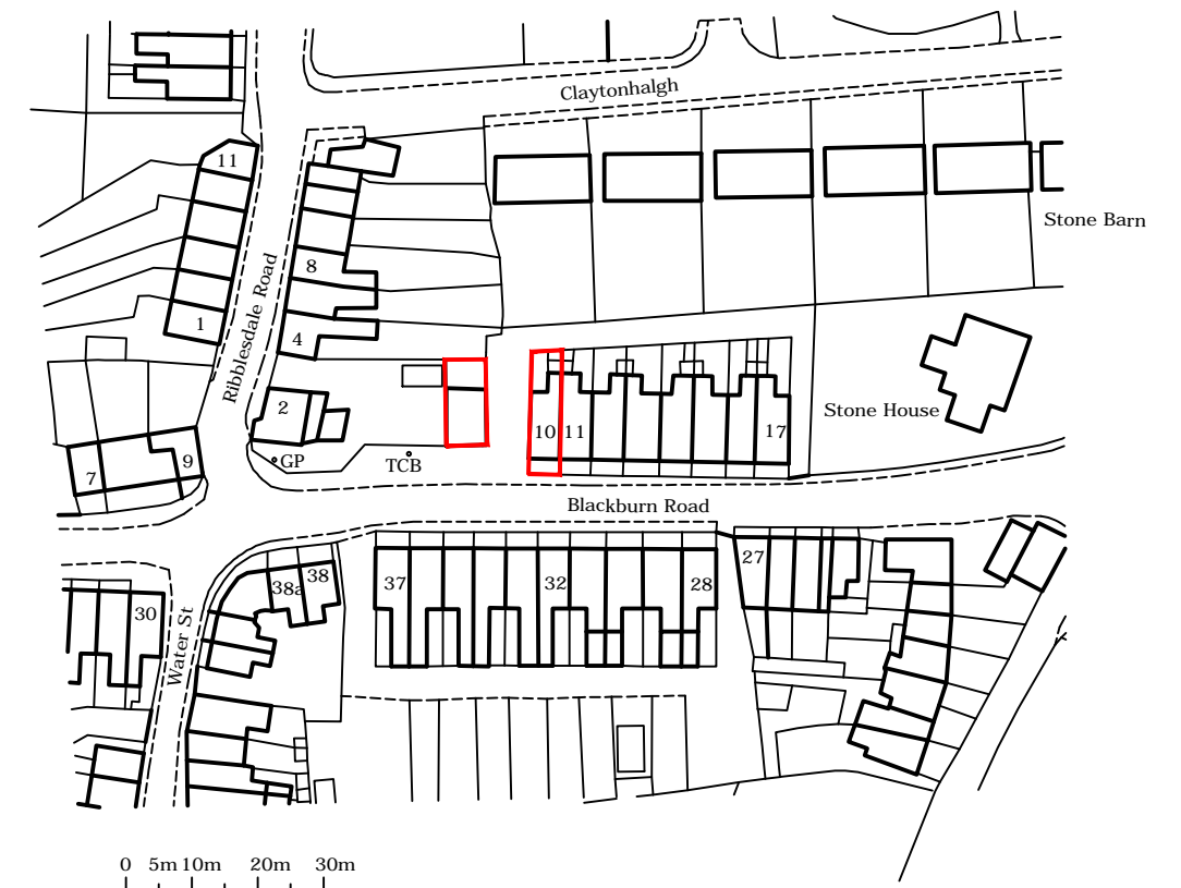
Location Plan scale 1:1250