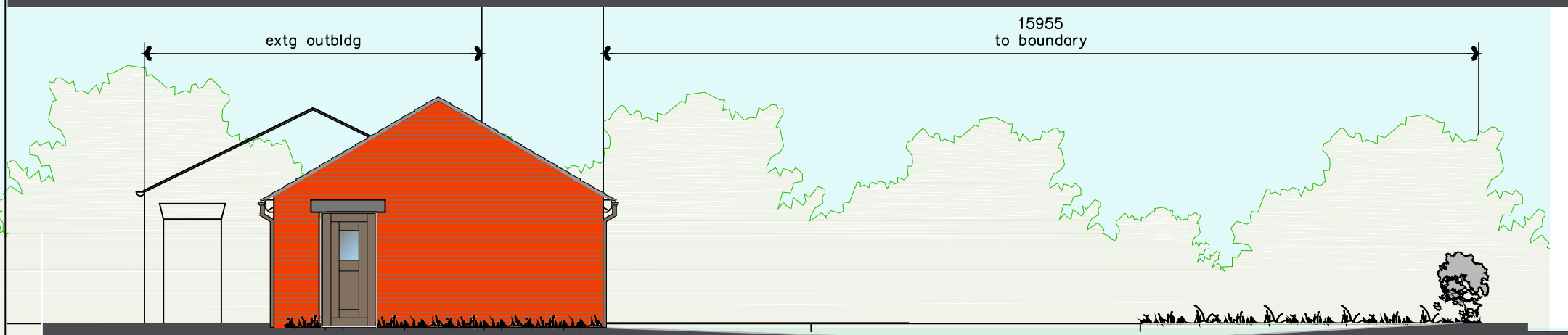
ELEVATION FROM CURTIS HOUSE

A 03.06.15 elevations amended to have roof opposite way