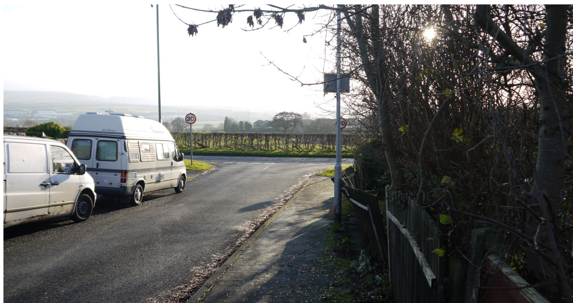
View looking south down Harewood Ave.