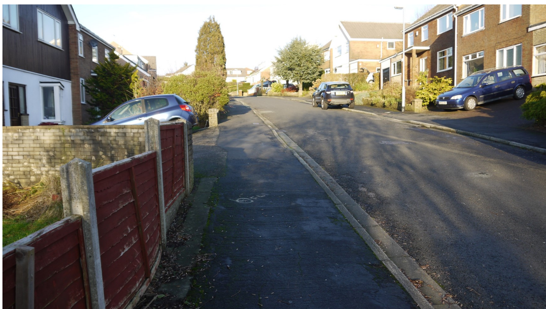
View looking north up Harewood Ave.