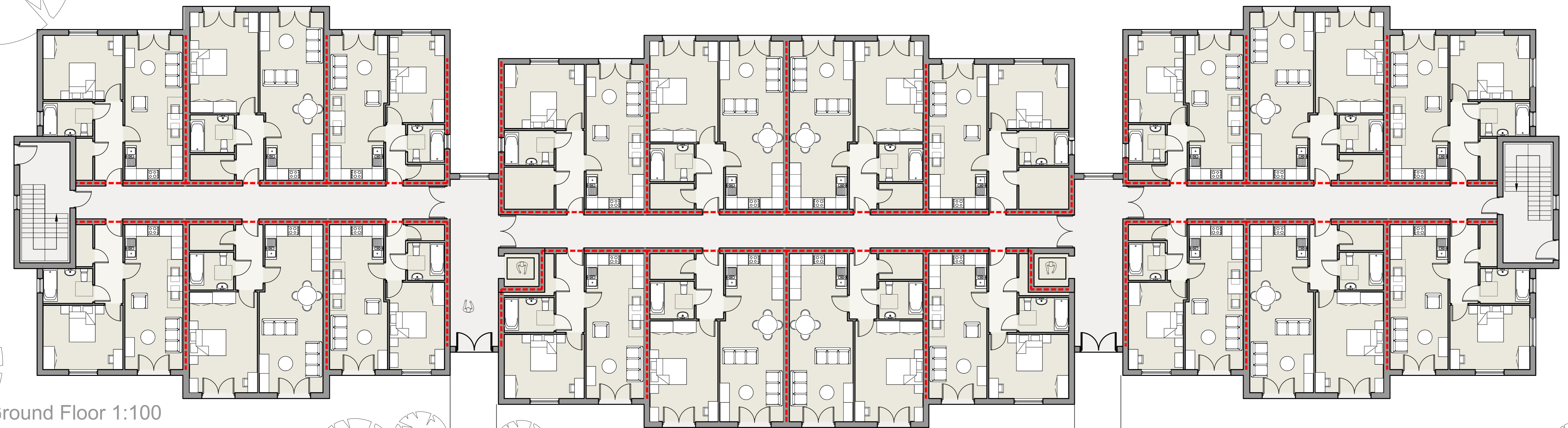
Proposed Ground Floor 1:100