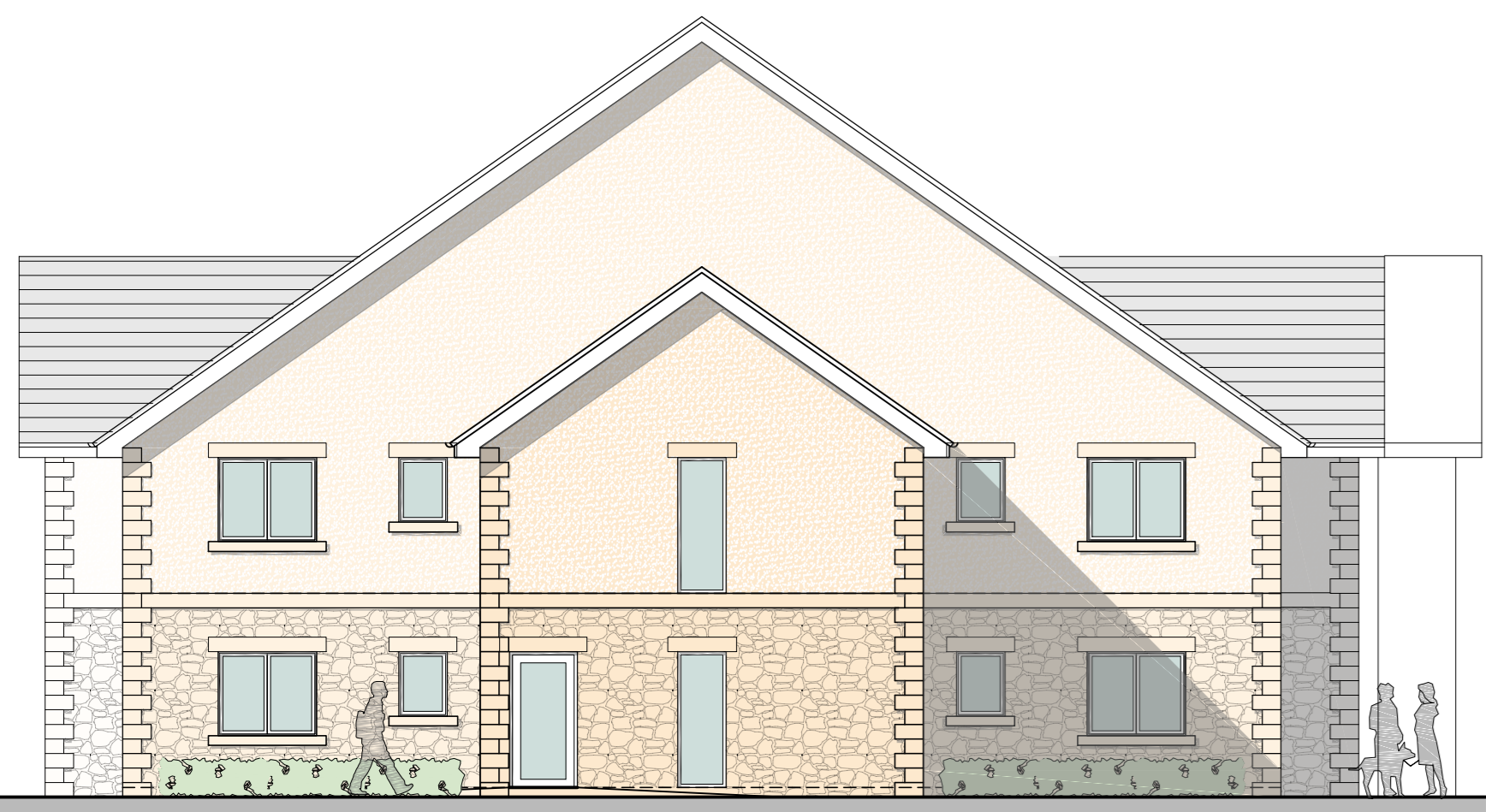
Proposed West Side Elevation 1:100