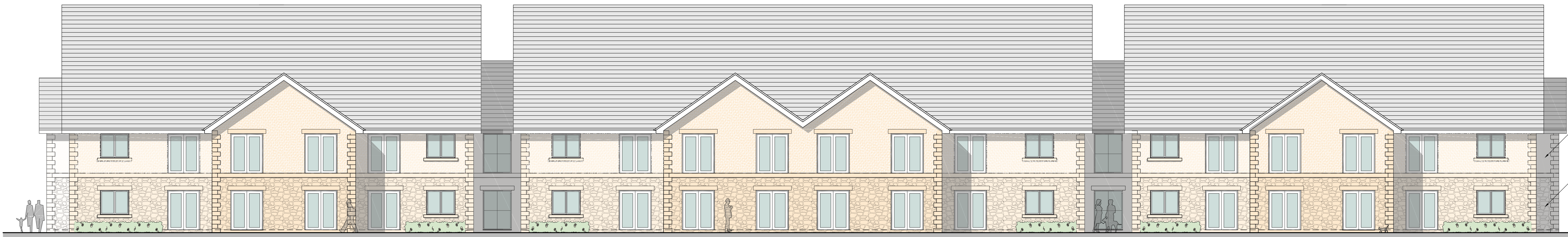
Proposed North/ Rear Elevation 1:100

Render to First Floor Imitation Stone to Ground Floor