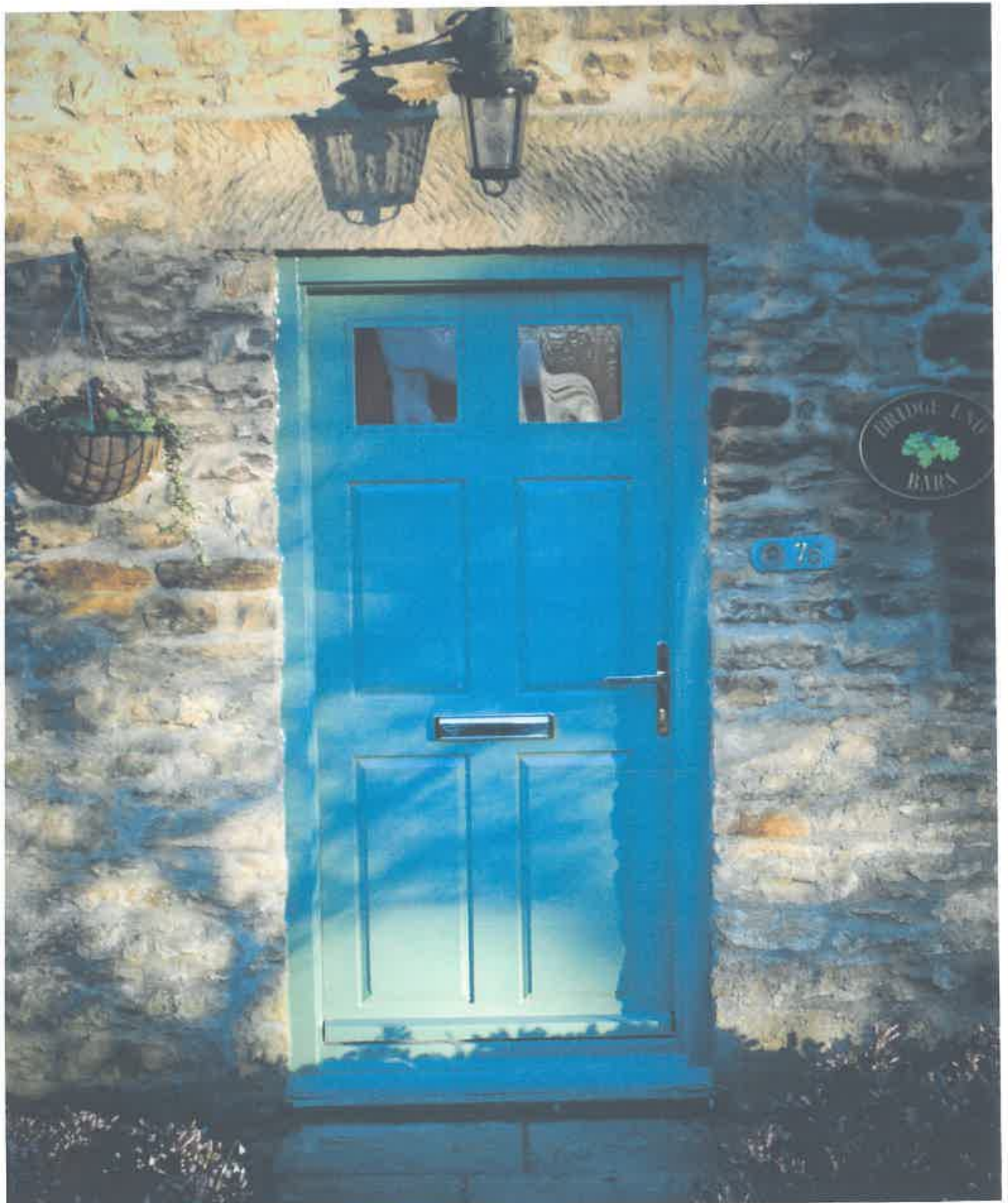
PROPOSED NEW FLOOD FRONT DOOR