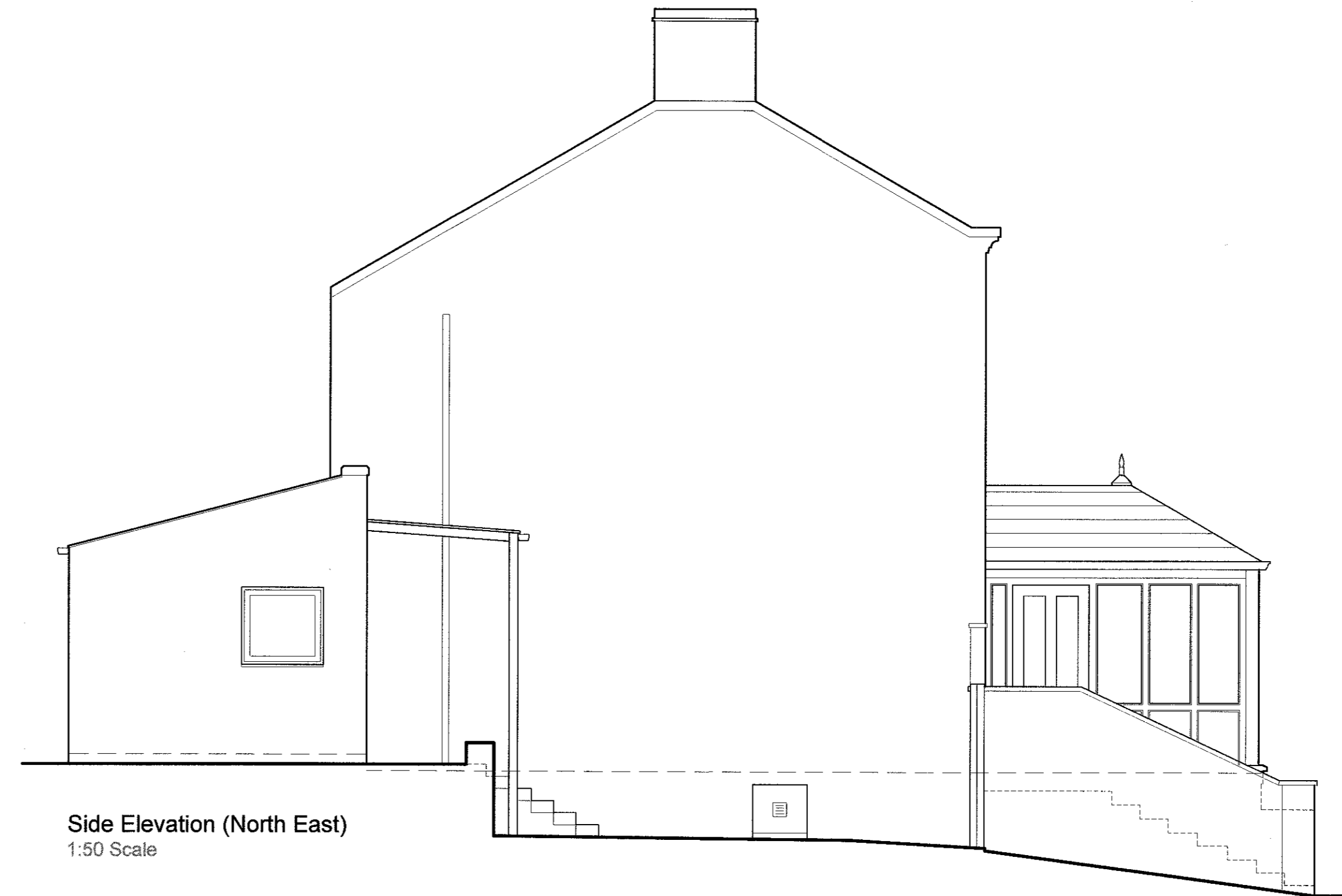
Side Elevation (North East) 1:50 Scale