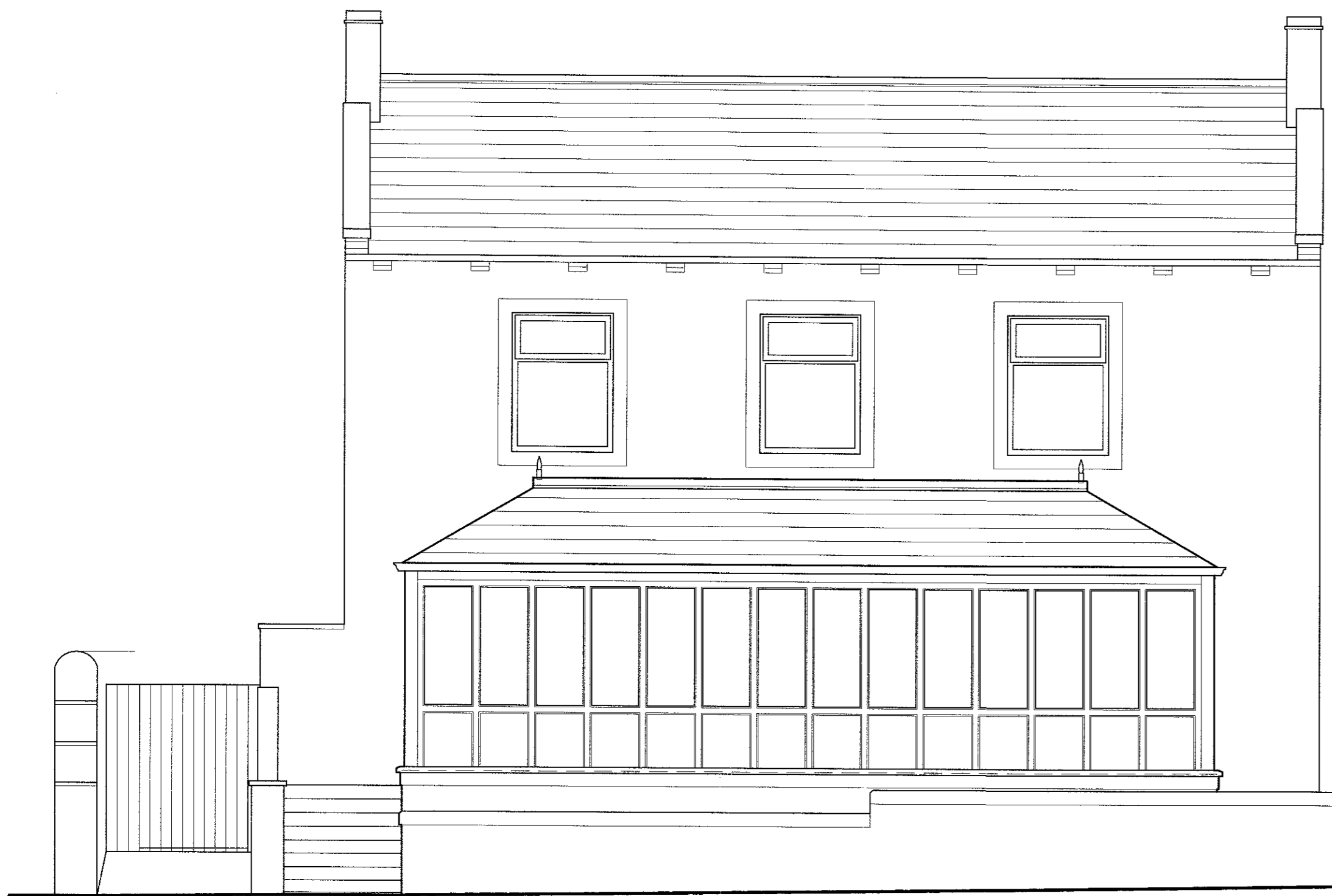
Front Elevation (North West) 1:50 Scale

This drawing is to be read in conjunction with all relevant Architect, consultant's and specialist drawings and specifications. The Architect is to be notified of any discrepancies before proceeding. Do not scale from this drawing. All dimensions and levels are to be checked on site. This drawing is subject to copyright. All work carried out before Planning and Building Permission has been granted is at the contractor's/clients risk.