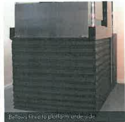
Bellows fitted to platform underside