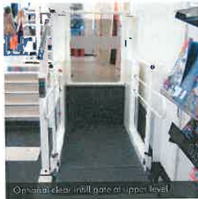
Optional clear infill gate at upper level