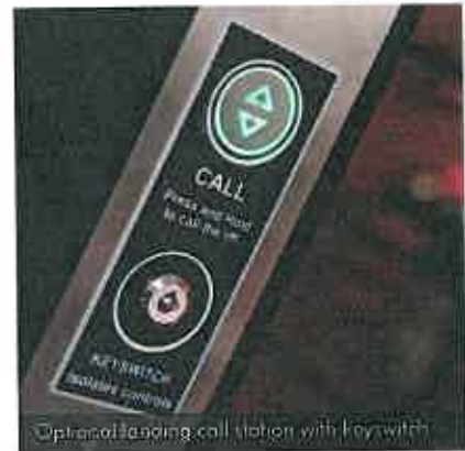
Optional loading call station with keyswitch