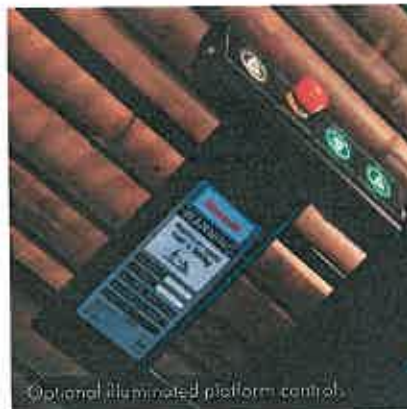
Optional illuminated platform control