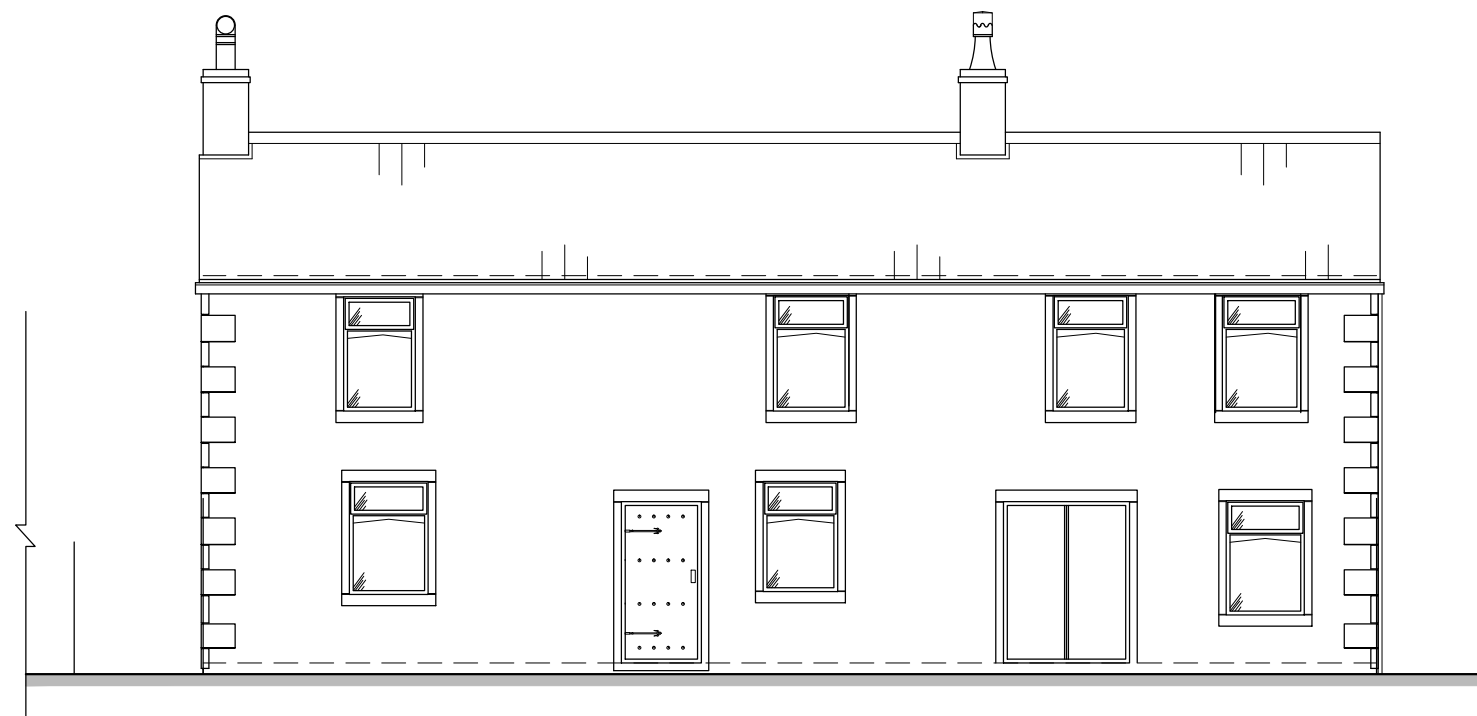
Existing Rear Elevation (South facing over garden)