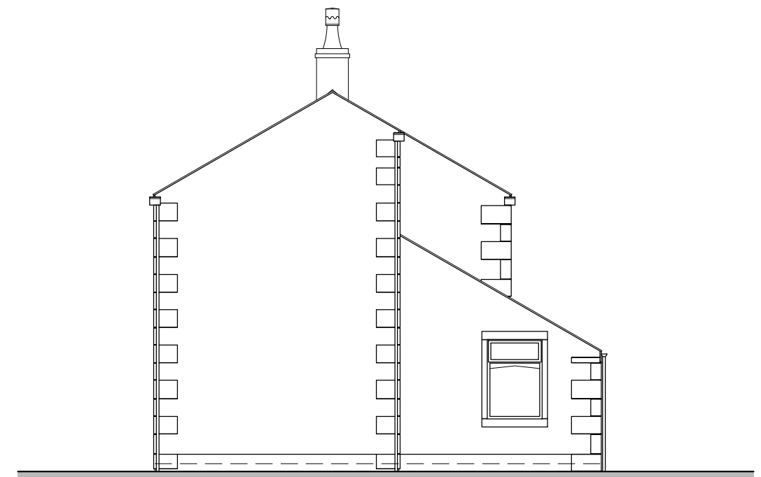
Existing Side Elevation (West facing stables)

NB: Existing adjacent Stables/Garage measured at time of survey. NB: Dimensions to be checked on site before work commences. All drawings subject to L.A and Statutory Authority Approval as necessary