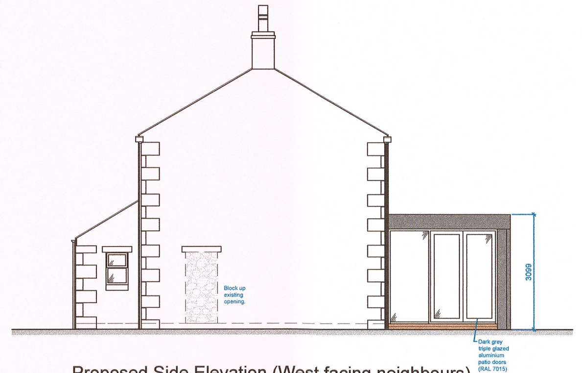
Proposed Side Elevation (West facing neighbours)