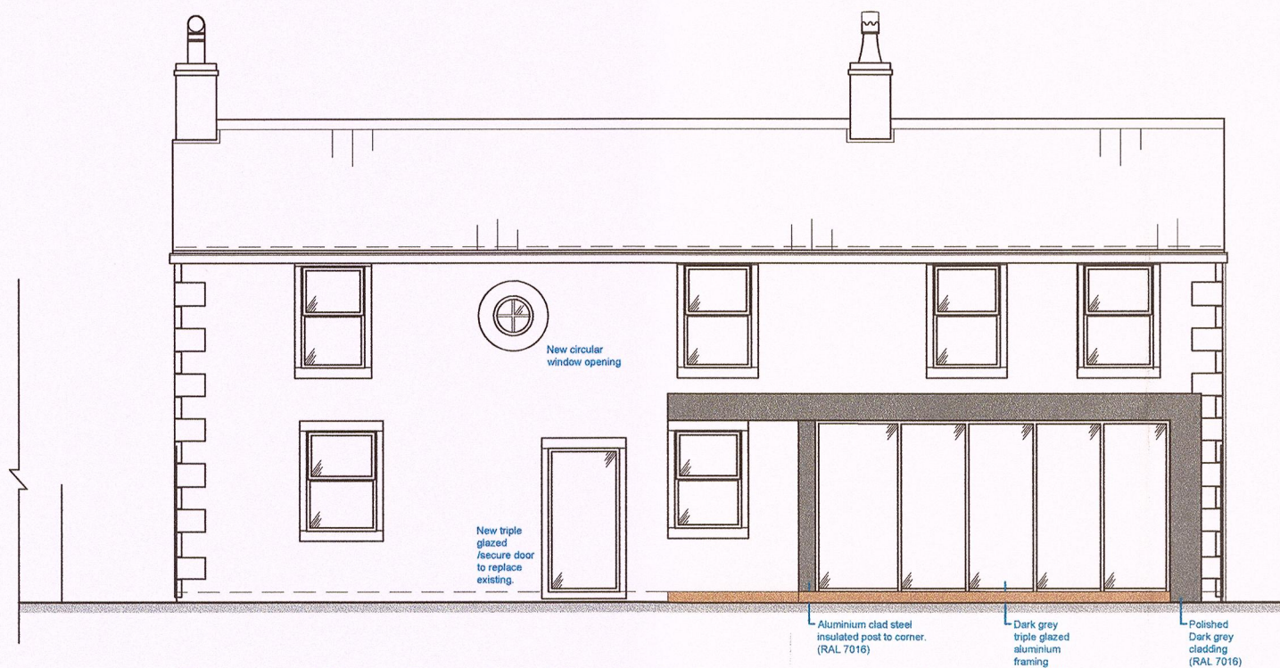
Proposed Rear Elevation (South facing over garden)